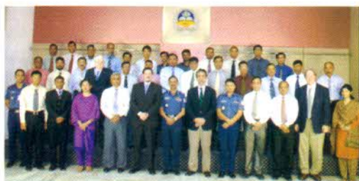
Participants of Border Control Management Course with the management of Police Staff College Bangladesh

Through a series of lectures, discussions, and problem-solving activities, you will learn how to identify terrorism threats to borders and solutions for neutralizing and mitigating those threats. You will also learn about current terrorist methods and threats, including an awareness of chemical, biological, radiological, nuclear, and explosive (CBRNE) materials and the equipment and methods used to build these devices. A variety of strategies for hardening the border against terrorist attack and exploitation by terrorists, from equipment and placement to policies and personnel, will be introduced. Throughout the course, you will apply strategies and tactics to fact-based, fictitious tactical problems in varied border environments.