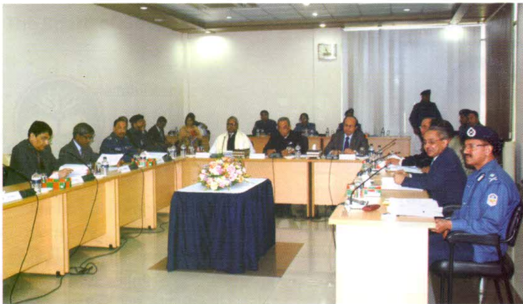
14 TH Meeting of the Board of Governors of Police Staff College Bangladesh on 26 December 2012