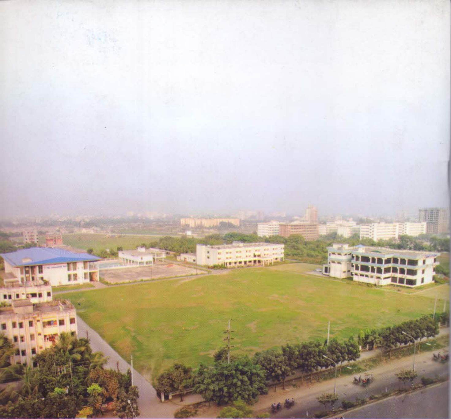
An aerial view of Police Staff College Bangladesh