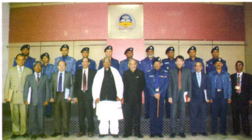
Honorable Chairman, Vice-Chairmen, Members, Member Secretary of Board of Governors of Police Staff College Bangladesh with the Directing Staff of Police Staff College Bangladesh