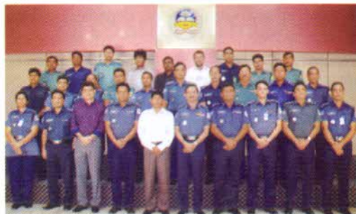
Participants of the Training on Community Policing for Senior Officers with the Management of Police Staff College Bangladesh

In the last quarter (September - December 2012) two courses on Community Policing were held at Police Staff College Bangladesh organized by Police Reform Programme (PRP). The first one was held