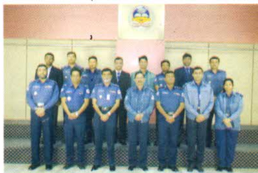
18 th Police Financial management Course

17 th and 18 th Police Financial Management Courses featured a number of renowned Guest Speakers who have illustrious career and expertise in their related areas. If we have a glimpse at the list of the Guest Speakers and their Session-Topics we will be able to understand the richness of the Course Contents.