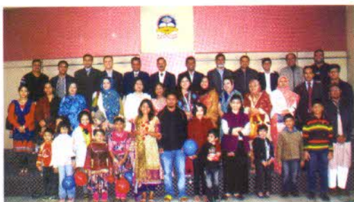
PSC Management with their family members