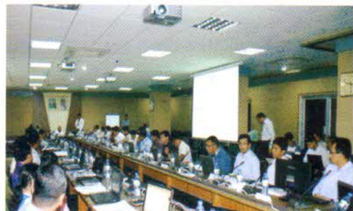
Inaugural Ceremony of 6 th Crime Intelligence Course