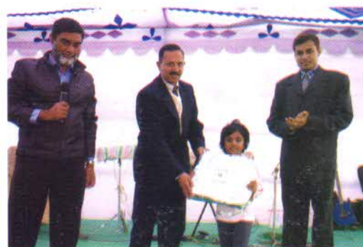
1st Prize for Memory-Test