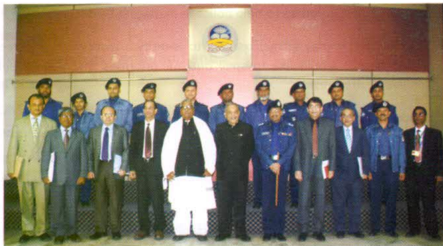
Honorable Chairman, Vice-Chairmen, Members, Member Secretary of Board of Governors of Police Staff College Bangladesh with the Directing Staff of Police Staff College Bangladesh