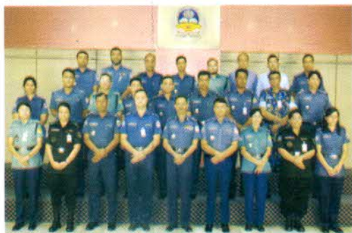
17 th Police Financial management Course

It is undeniable that the improvement of operational performance of today's police service irrespective of both developing and developed countries of the world calls for high quality training; delivering the challenging management, leadership and operative program; reflecting need-based priorities for senior police officials.