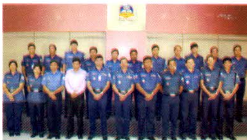
4 th Crime Intelligence Course

Undoubtedly, technology plays a crucial role in today's police investigations. But repeated usage of CDR as evidence leads to leaking investigators' formula out causing future criminals smarter to avoid similar mistakes and to setting him or his associates off in further-trapped into investigators' technique. CDRs are, therefore, to be used as indicators of crime intelligence, not as 'evidence', like it is mistakenly done very frequently. Another amazing crucial factor is that CDRs are usually dealt and analyzed by the officers, who neither have any skill or training on this kind of analysis nor have necessary software to analyze or generate necessary intelligence. This results in very low output even from a source of potential high-quality data. The question is how long we will allow low-skilled investigators to deal with such crucial data. Also, how long we will continue our reactive policing - a policing without support of criminal intelligence?