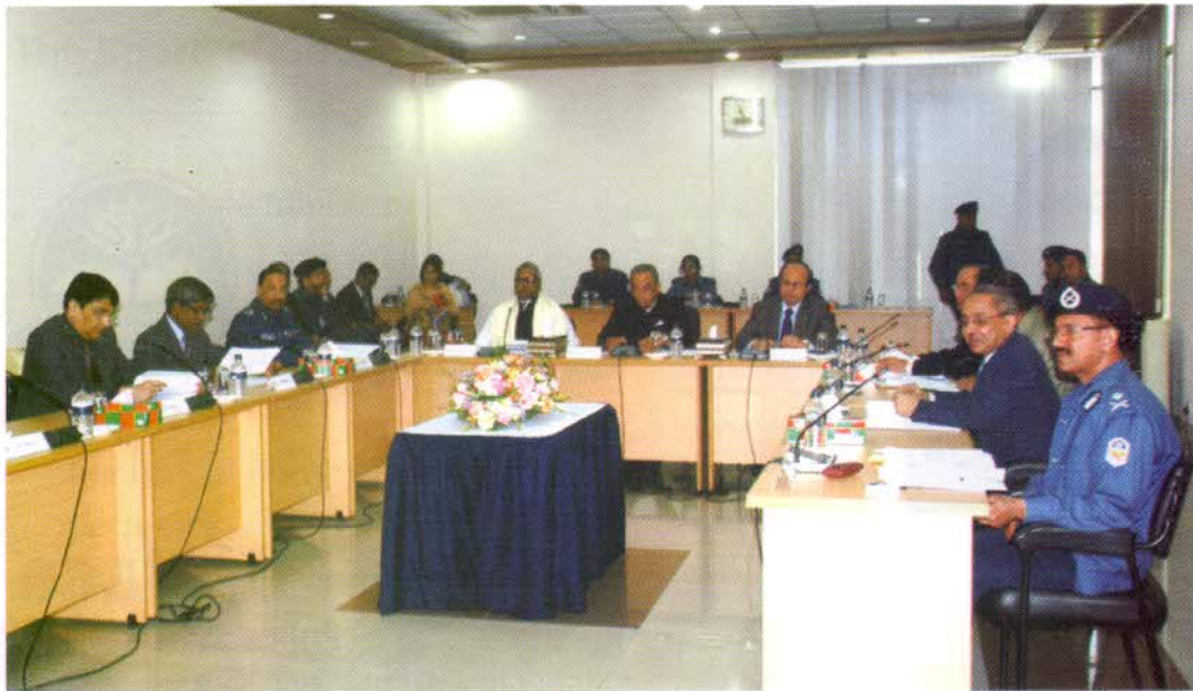
14 TH Meeting of the Board of Governors of Police Staff College Bangladesh on 26 December 2012