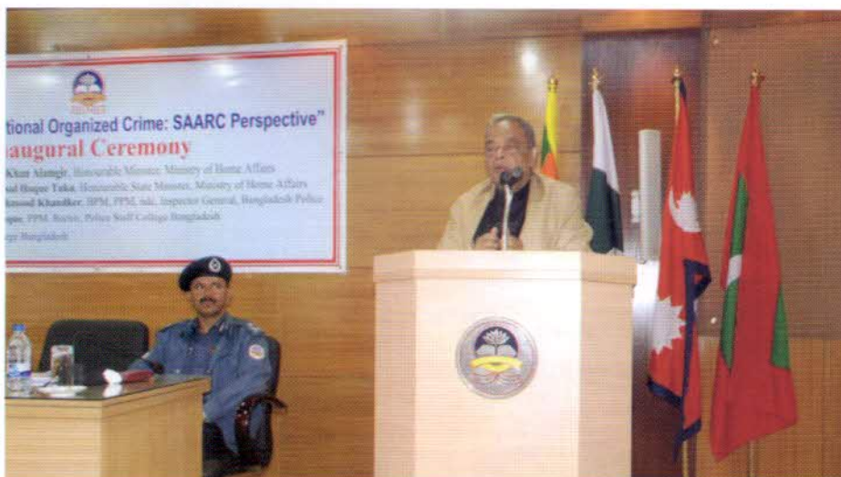
Dr. Muhiuddin Khan Alamgir , Honorable Home Minister, Ministry of Home Affairs, Government of the People's Republic of Bangladesh, addressing on the opening ceremony of the 1 st SAARC Course on “Transnational Organized Crime: SAARC Perspective”