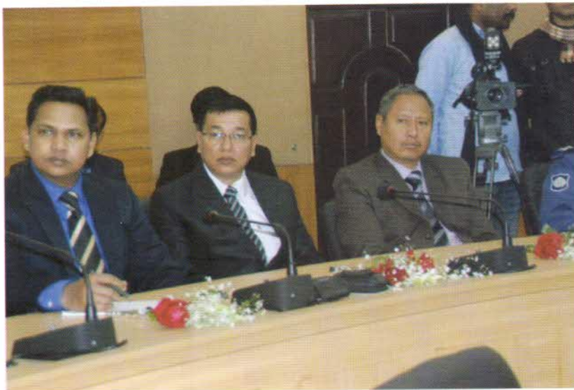
A section of participants in the opening ceremony of the 1 st SAARC Course on "Transnational Organized Crime: SAARC Perspective"