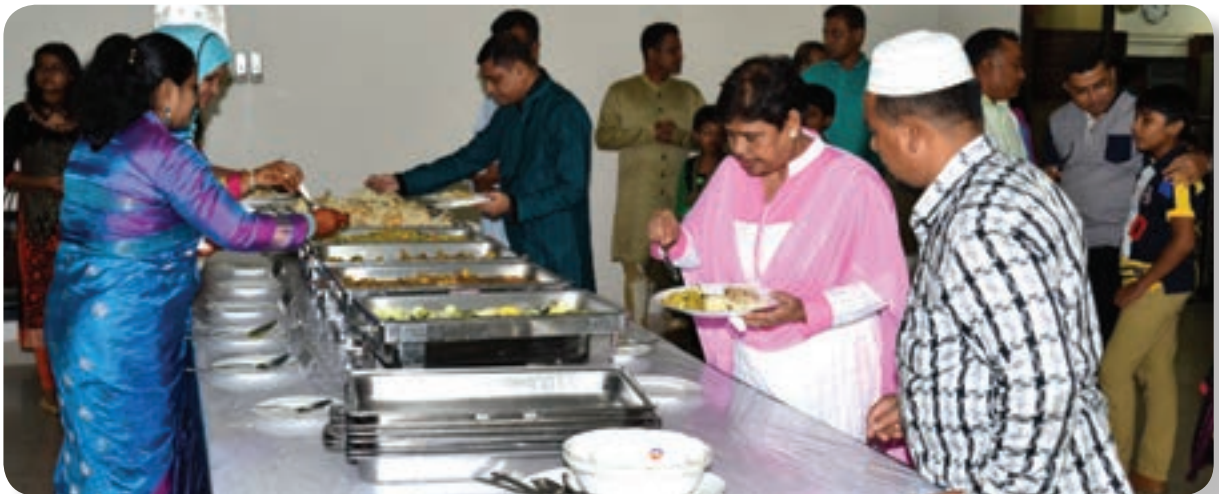
Rector, PSC are enjoying food at Eid Reunion 2015 with PSC members famely.