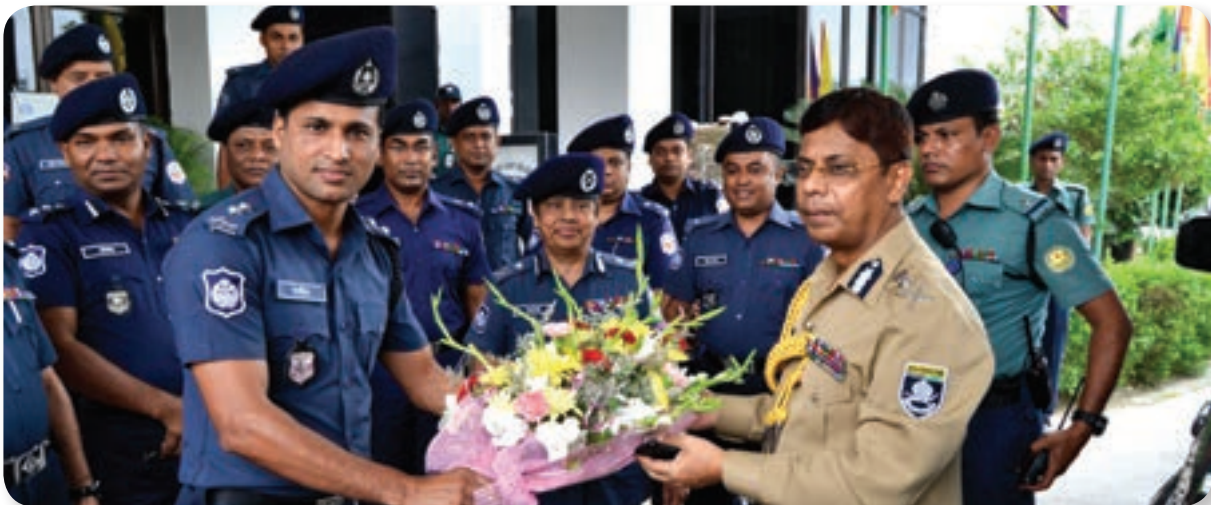
A warm reception of IGP with a floral wreath on his arrival at PSC to open Interpol course.

PSC is delighted to host INTERPOL sponsored special training course on 'Intelligence Analysis for Tiger Range Countries' - the first of its kinds happened in Bangladesh from 23 Aug. - 03 Sept. 2015. These tiger range countries are: Bangladesh, Bhutan, Cambodia, India, Indonesia, Laos, Malaysia, Nepal, Thailand and Vietnam. However, Bhutan did not participate in this training program.