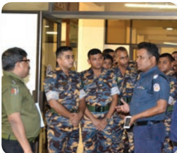
PSC faculty with visiting Ansar Academy officers.