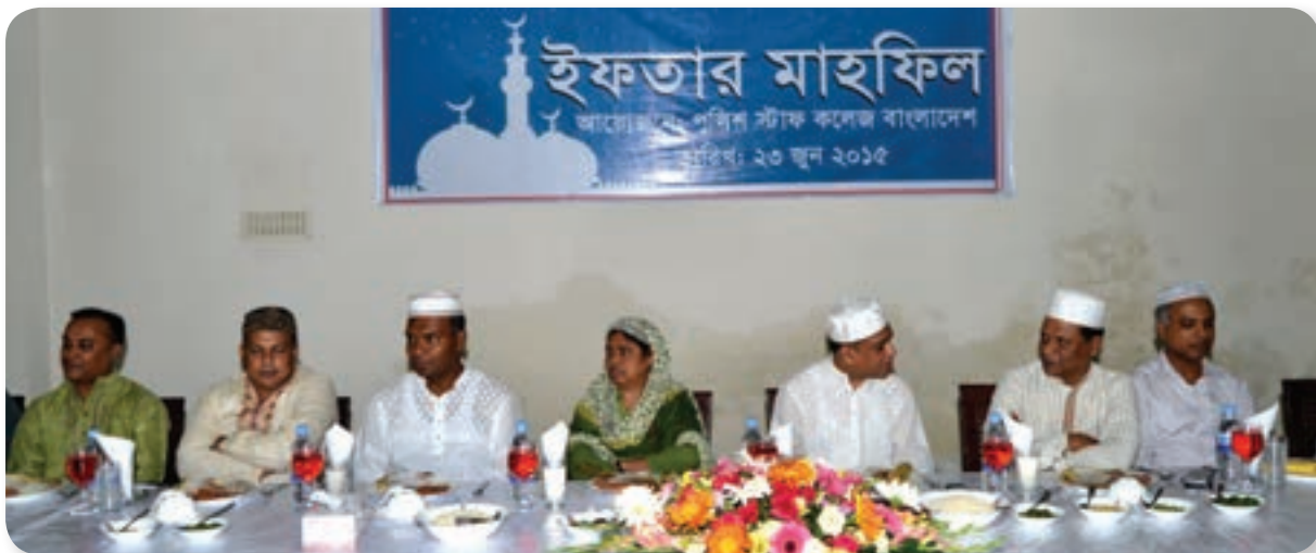
Rector & other senior officials of PSC at Ifter Mahfil 2015