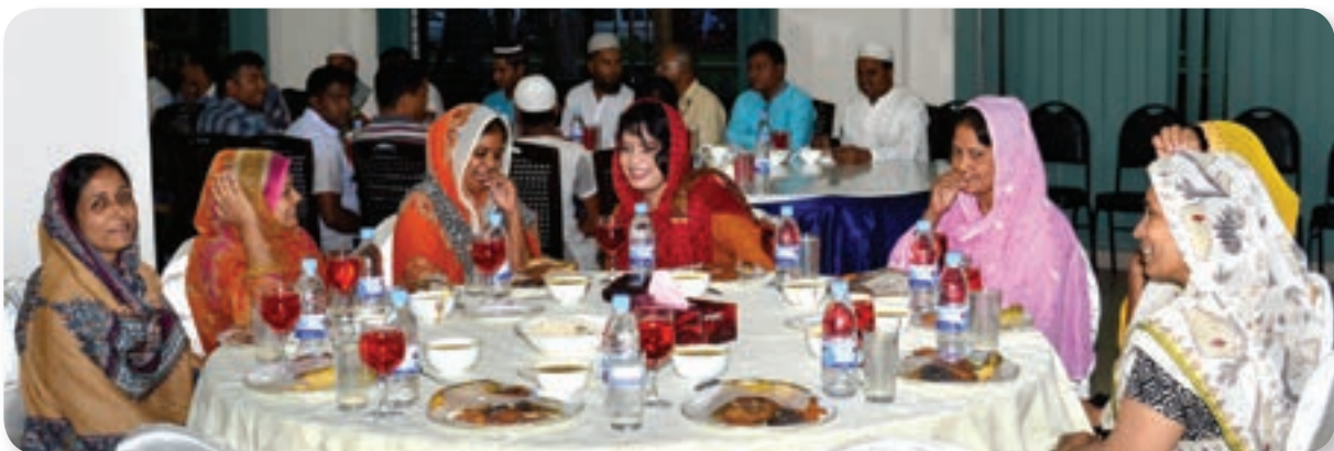
PSC's female staff are enjoying the iftar.

Another noteworthy to mention that, PSC always extends its hands to BPWN. PSC was the host of the first ever International Women Police Conference in 2012, providing its training, dormitory and service facilities in full time. PSC was also the host of BPWN's 2nd Annual Conference in 2013 which was held in PSC Convention Hall.