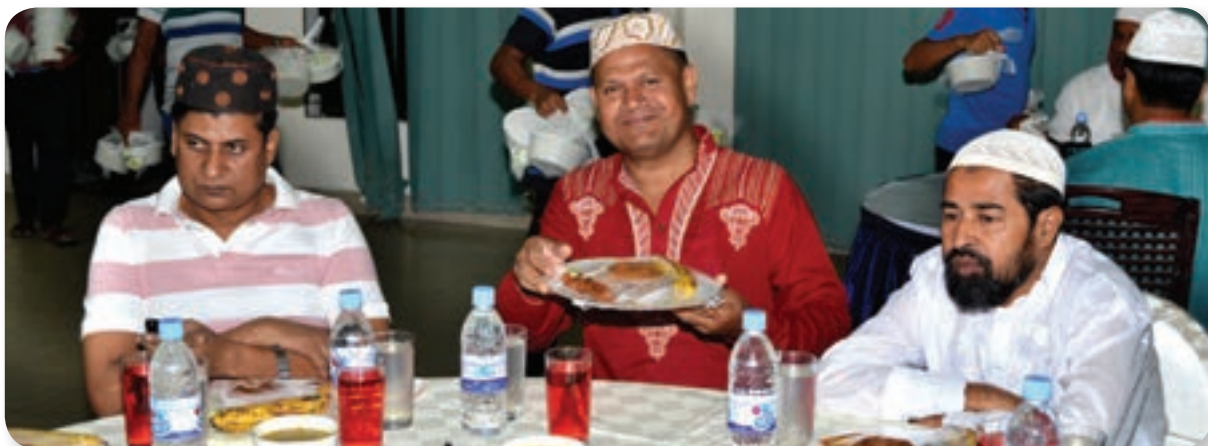
PSC Staff in a cheering mood.