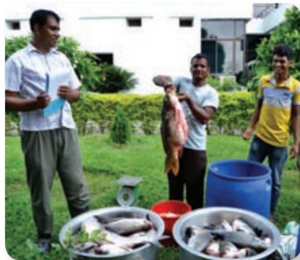
A Moment of fishing at PSC pond.