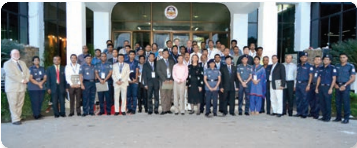
Participants, dignitaries and PSC faculties with the Law Minister, US Chief of Mission and the Rector during the closing ceremony of the workshop on Combating Wildlife Trafficking in Bangladesh on 13-08-2015.

The closing ceremony of this workshop became worthy and elegant with the gracious presence of Mr. Anisul Huq, honourable Minister, Ministry of Law, Justice and Parliamentary Affairs, Government of Bangladesh as Chief Guest and Her Excellency Ms. Marcia Stephens Bloom Bernicat, US Ambassador to Bangladesh as special guest. Both the dignitaries emphasized on keeping strong collaboration at national and international level to fight against tiger crimes. The closing ceremony was ended with light refreshment.