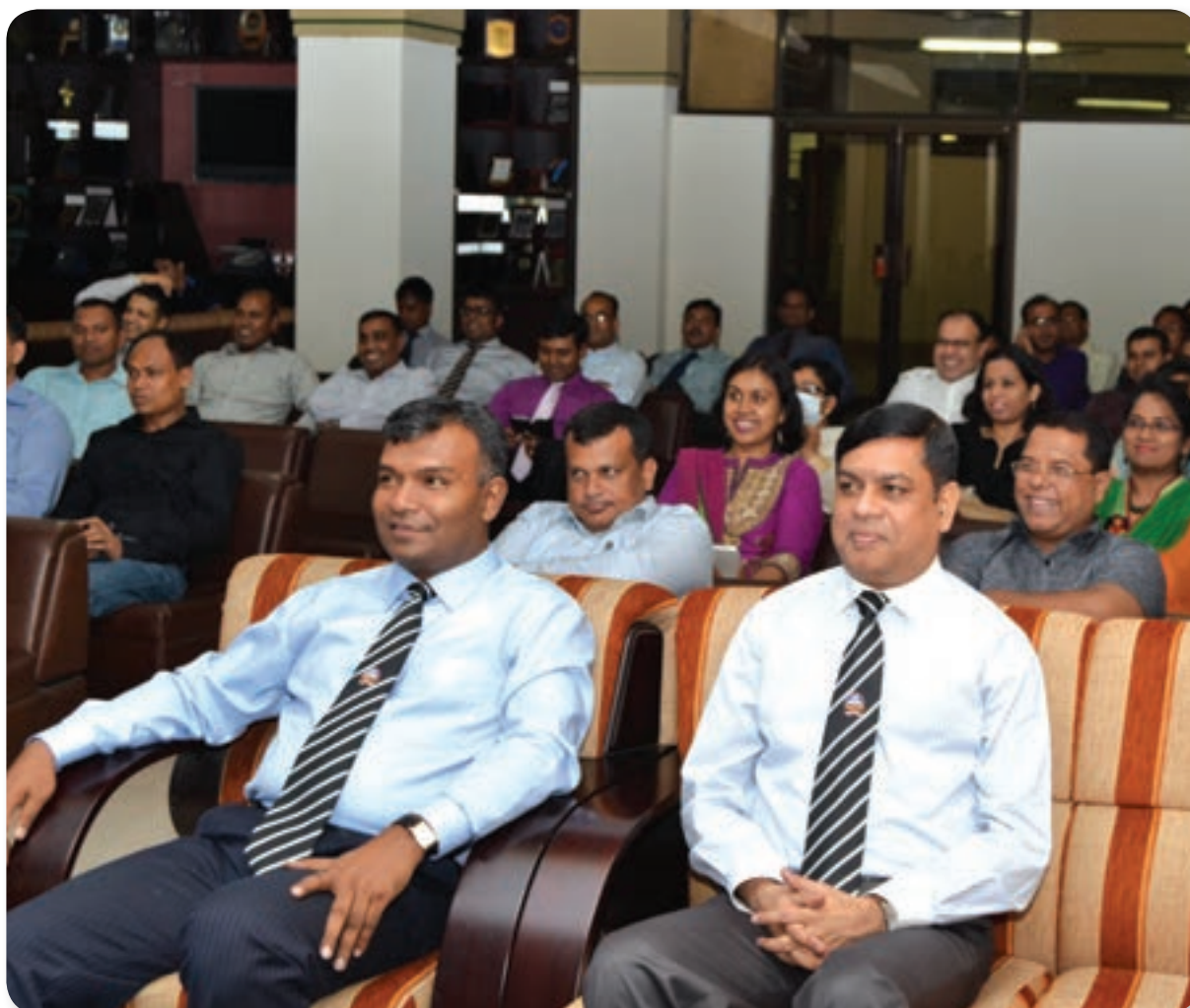
MDS (Training) and (RP&E) are with the newly promoted Ssp & other faculty of PSC.