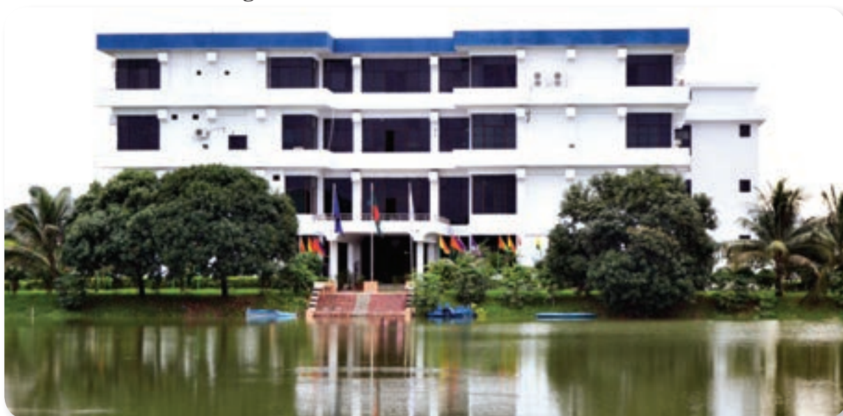
PSC Administrative Building

The third floor construction work of PSC's administrative building is at the final stage. It is now served for academic Purposa as well. Top floor of this four storied building is going to accommodate Vice Rector's office, one 150 seated conference room, one mock test room, two Superintendent of Police's office, offices for Additional and Assistant Superintendents of Police and accounts office.