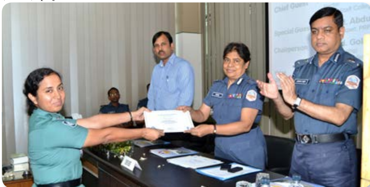
A participant is receiving certificate from the Rector in PRP sponsored ToT course

In this quarter, only one type of two courses have been done at PSC in partnership with the Police Reform Programme (PRP): ‘ToT on Human Rights Course’. The course was conducted in two phases 10-14 May 2015 and 26-27 May 2015 respectively.