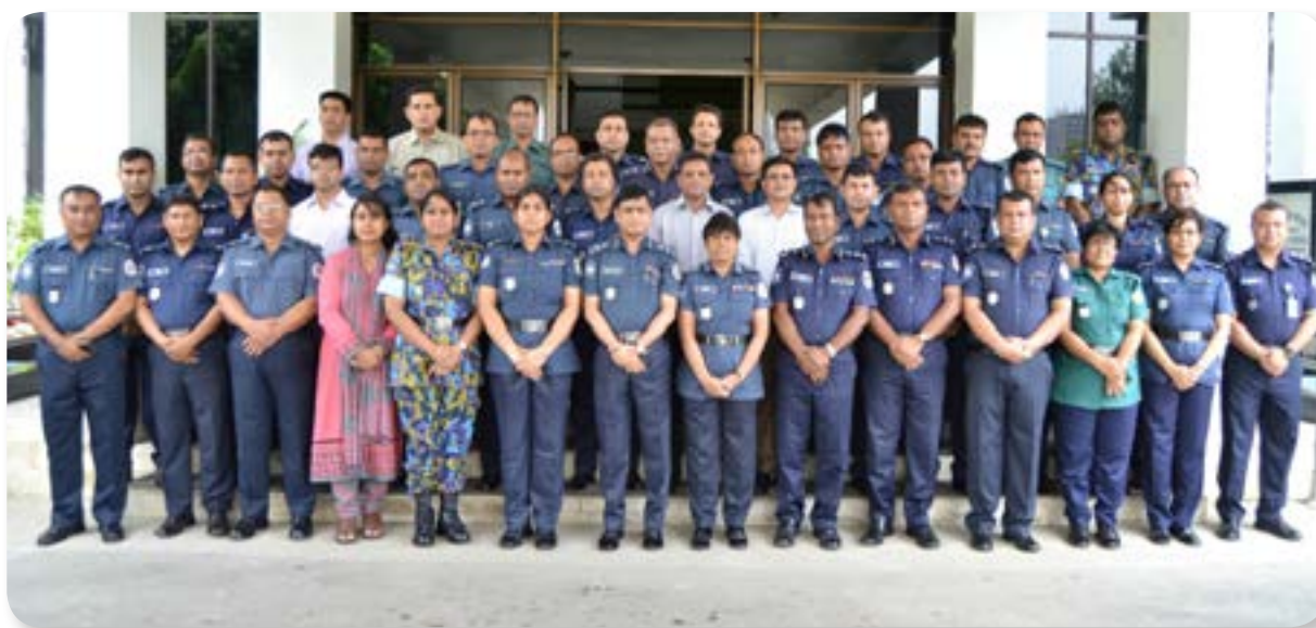
Newly promoted SsP with the Rector and PSC faculties during the inauguration of '2nd Orientation Course for Newly Promoted SsP'.

For the second time PSC has arranged an orientation course for the Superintendents of Police who got fresh appointment as SP. Before joining to their respective appointments, they have to undergo this short leadership-based training at PSC.