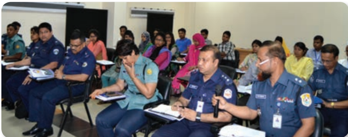
Participants are in a session on research methodology