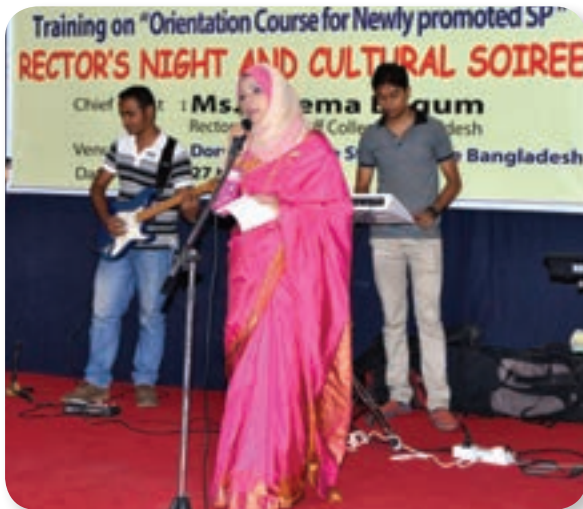
Rector's night & cultural soiree at PSC