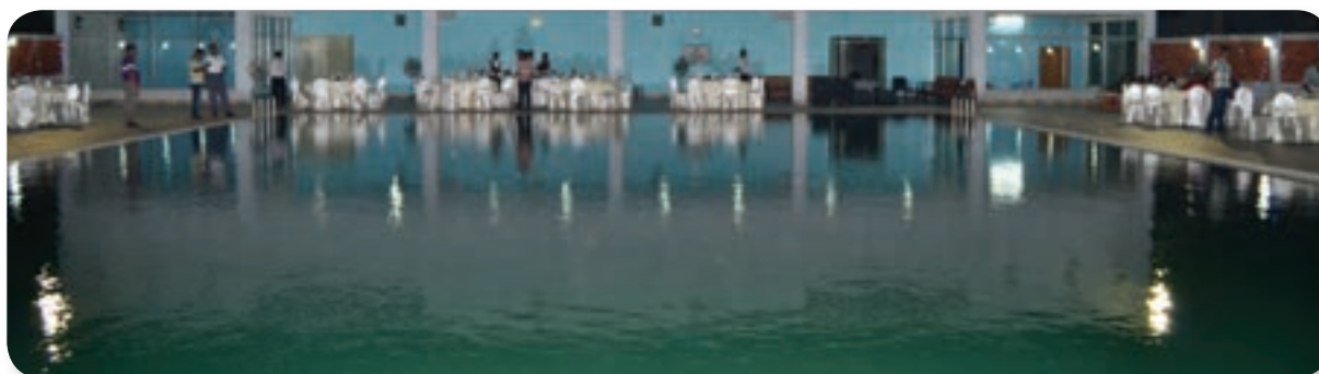
View of the PSC swimming pool

PSC has continued to expand its strategic partnership both at home and abroad with its stakeholders, such as National Human Rights Commission, Asia Foundation, Bangladesh Environmental Association, US embassy, Denmark Government, PRP, ICPVTR and UNICEF.