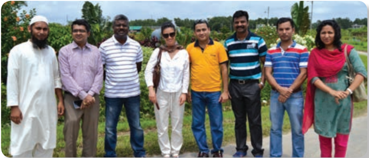
PSC faculty with visiting foreign police officer at Bangabandhu Safari Park in Gazipur.