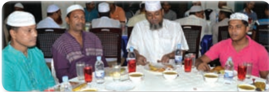
PSC staff is observing Iftar with due solemnity