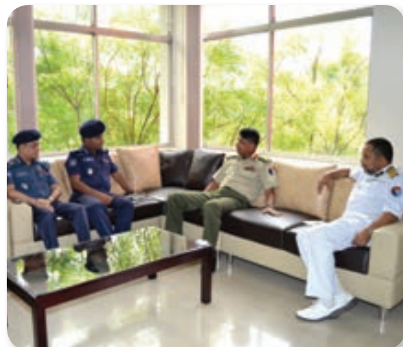
Senior officials of PSC with visiting DSC & Staff College