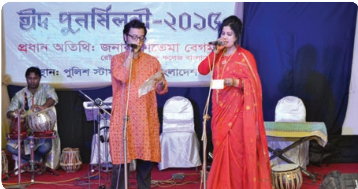
The artists are performing in the reunion program of Eid-ul-Fitre on 23-7-2015