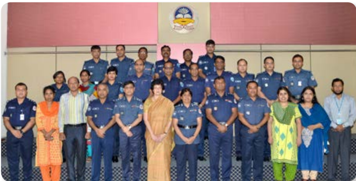
Participants of 'Training of master Trainers on GBV SOP and Training Module with PSC faculties and instructor from Nepal.