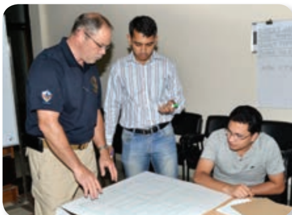
Participants are engaging on group exercise with the ATA instructor of TCC course