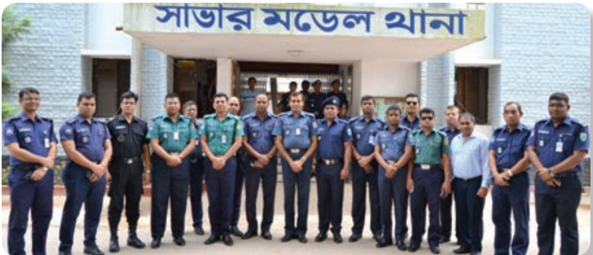
Visiting 5th CPCM course members are in front of Savar Model Thana.