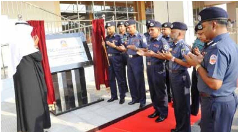
PSC Convention Hall

PSC Convention Hall is newly established structure for big events, training and demonstration, force briefing and debriefing, UN peacekeeping training and social activities.