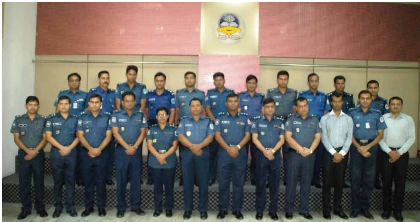
Directing Staff of Police Staff College Bangladesh, Representatives from PRP and the participants of 'Training on Presentation and Facilitation Skills' on 11-14 May 2014.

Making presentations can be a daunting task, particularly when the number one fear for many people is public speaking. Finding ways to calm those jitters, adequate and appropriate preparation, structure and delivery of material are essential to successfully getting message across. Therefore, Police Reform Program (PRP), UNDP organized training program on Presentation and Facilitation Skills from 11-14 May 2014 and 25-28 May 2014. There were 27 participants of the rank of Sub-Inspector to ASP in the course.