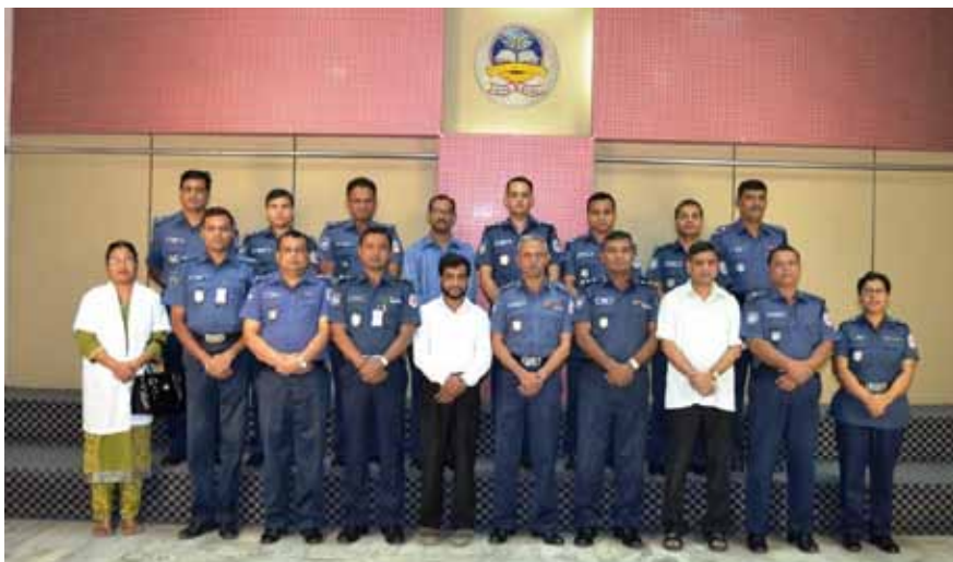
The Instructor of English Language Course and the Participants of Police Staff College Bangladesh

'English Language Course' started at Police Staff College Bangladesh from 24 June 2014 for 03 (Three) months. This course is organized under Genius Bangladesh Intensive Training Programme and Spoken English and BBC Accent for Bangladesh Police. All Directing Staff of Police Staff College Bangladesh took part in the course. The overall objective of this course is to enhance the spoken English skills of the participants.