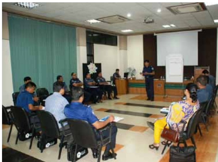
Participants are in a session of 'Training on Presentation and Facilitation Skills'

The very aim of this training is to make the participants confident in presentation and facilitation skills so that they are able to facilitate different training sessions in different in-service training institutions of Bangladesh Police. The participants are taught adult education, difference between education and training, lesson plan, different methods & materials of training. Besides, the participants had hands-on exercise on conducting a session in class room environment.