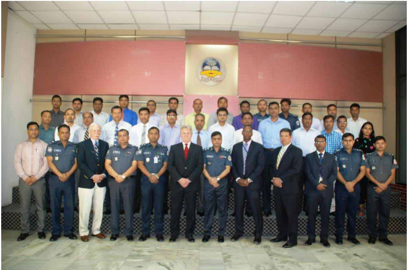
Directing Staff of Police Staff College Bangladesh, Representatives from Regional Security Office, US Embassy Dhaka, Instructors and the participants of 'Interviewing Terrorism Suspects Course (ITSC)' on 04 May 2014.

Interviewing Terrorism Suspects Course (ITSC) was held at Police Staff College Bangladesh from 04-08 May 2014. The course was coordinated by Regional Security Office, US Embassy Dhaka. Twenty-Seven participants from Sub-Inspector to Additional Superintendent of Police attended the course.