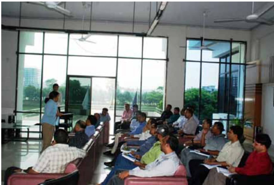
A group discussion session on the lobby of the 1st floor of PSC in relation to CIM

Course topics included initial scene assessment and establishment of incident objectives, command and operations, incident action planning, resource management, communications, incident support and coordination, human rights and post action reporting and continuous improvement. Throughout the course, participants applied knowledge gained in the classroom to assess current policies, plans, and procedures as a means to identify opportunities for improvement. On completion of the course, participants will have developed an action plan for improving their incident management protocols using steps that they identify and develop.