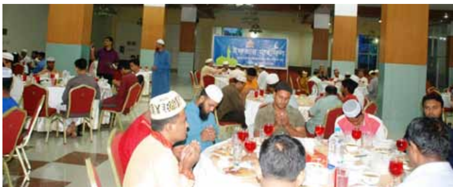
Iftar Mahfil 2014 on 06 July 2014