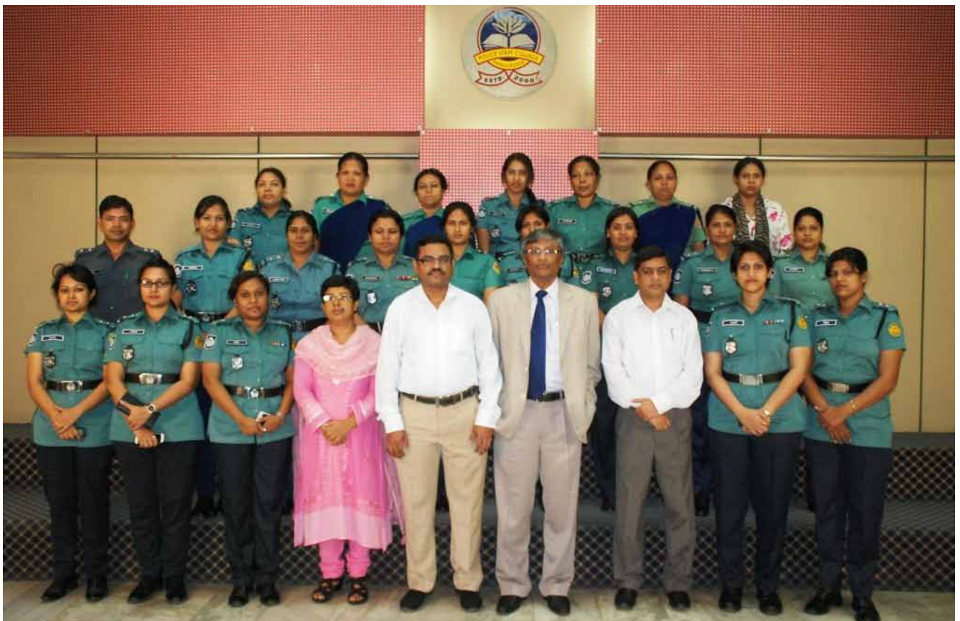
Directing Staff of Police Staff College Bangladesh and the participants of the training on 'Human Rights and Policing' organized at Police Staff College Bangladesh from 07-08 June 2014.

The overall objectives of this training are to emphasize that knowledge of human rights is an essential professional requirement of all personnel serving in law enforcement agencies, to clarify the idea about policing in a democratic society and to have a sound knowledge about the maintenance of public order especially during the election period.