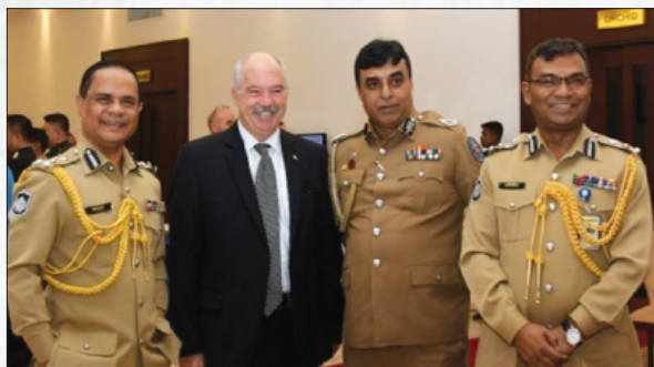
Inspector General of Sri Lanka Police, Head of NCB, Dhaka & MDS (Training), PSC are seen on the lobby of the conference hall