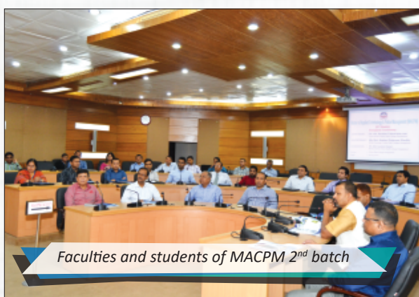
Faculties and students of MACPM 2 nd batch