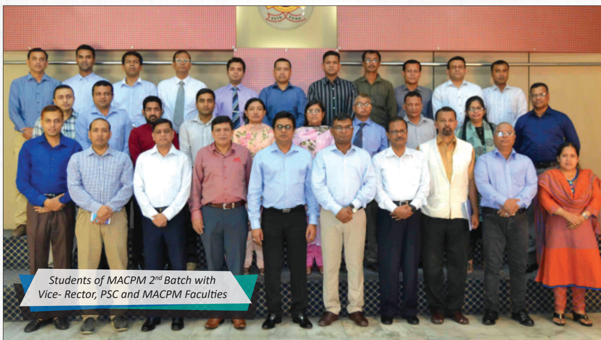
Students of MACPM 2 nd Batch with Vice- Rector, PSC and MACPM Faculties