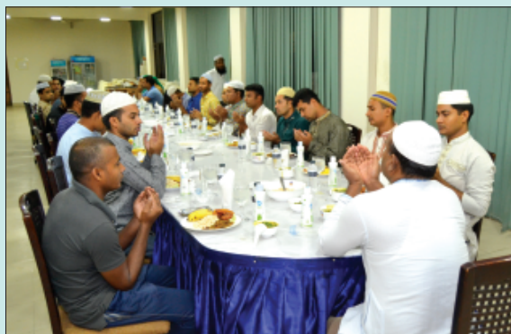
Prayer during Iftar Mahfil