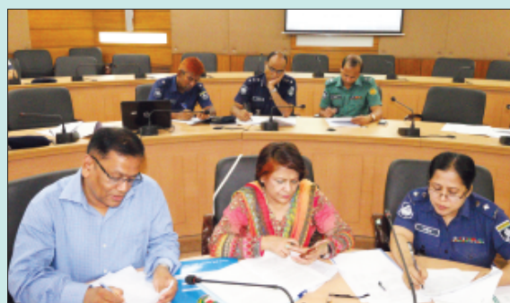
Participants are busy in brain storming at a workshop on Bangladesh Police Training Policy