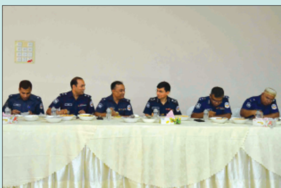
PSC Staff enjoying lunch on Eid reunion program