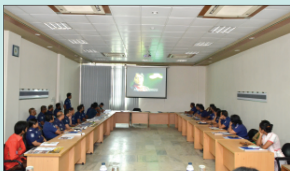
Participants enjoying a documentary "SOLD" at an awareness building workshop on Human Trafficking