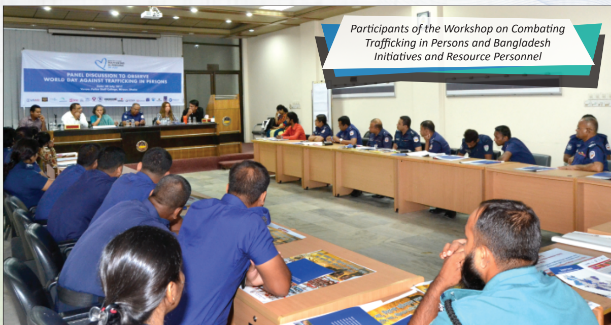
Table-14: PSC CONDUCTED COURSES from May-August 2017 ( at a glance)