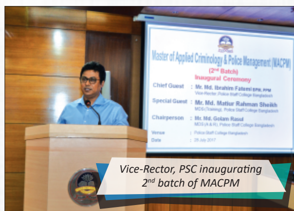
Vice-Rector, PSC inaugurating 2 nd batch of MACPM