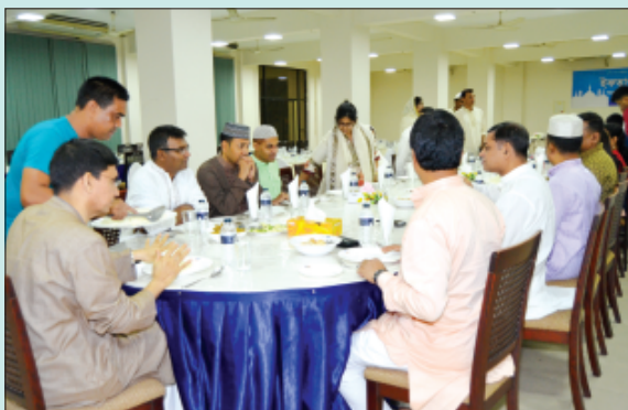
Rector, PSC at Iftar Mahfil with senior PSC faculties