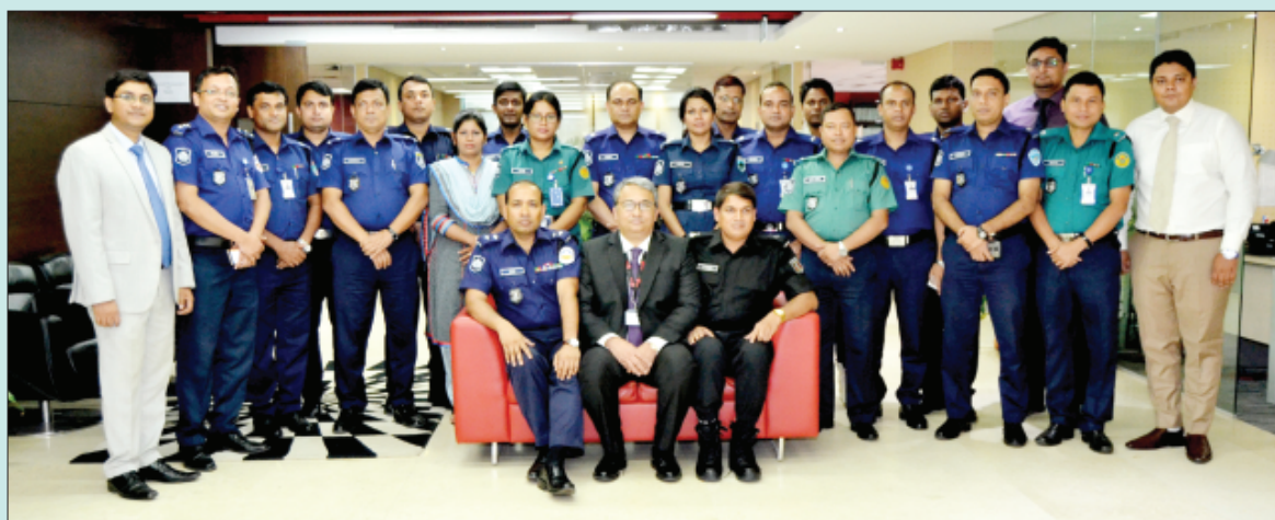
Participants of 33 rd PFMCC in a visit at UCBL with Director (Training), PSC