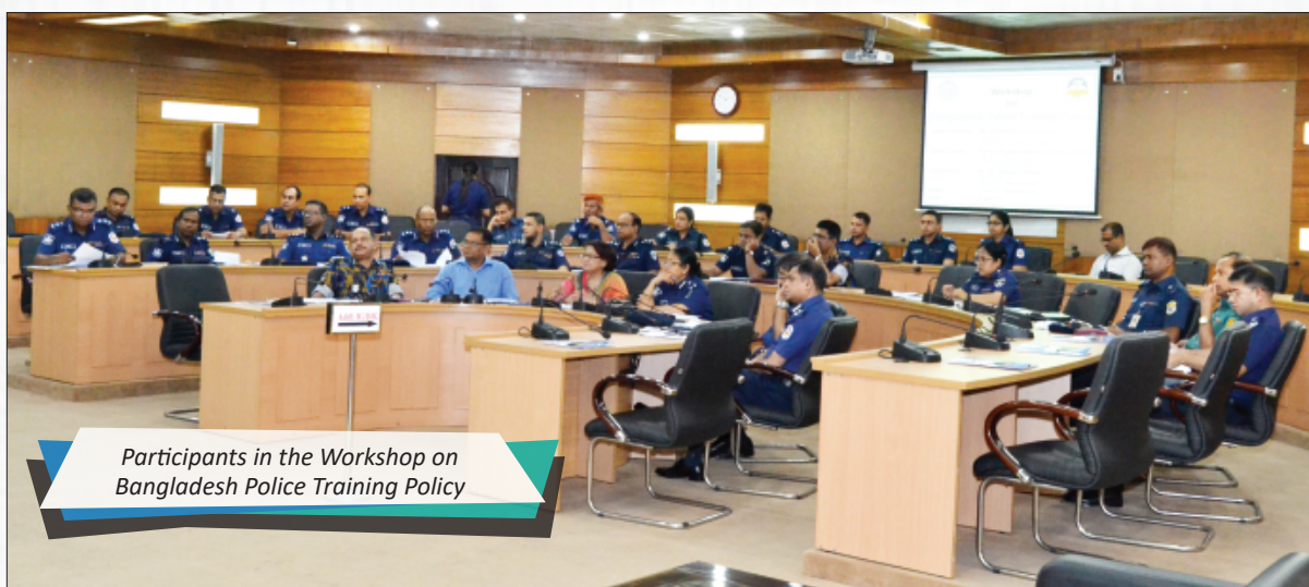
Participants in the Workshop on Bangladesh Police Training Policy