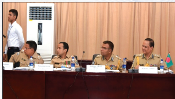
Delegates of Bangladesh are in a discussion session with the officers of INTERPOL member countries