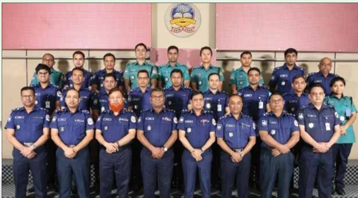
Participants of Crime Administration Management Course with the Faculty of PSC