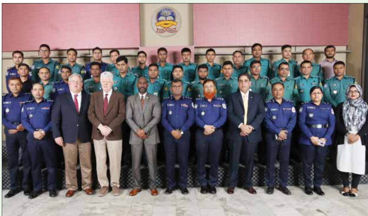
Participants of ITA Course with the Faculty of PSC

The course was organized by Anti Terrorism Assistance (ATA) of US State Department, US Embassy in Bangladesh. Terrorist Interdiction Program provides the immigration authorities of partner nations with a computer database system that enables identification of suspected terrorists attempting to transit air, land or sea ports of entry. The Terrorist Interdiction Program seeks to constrain terrorist mobility globally by helping countries at risk from terrorist activity, who should enhance their border security capabilities. The course teaches participants a computerized watchlisting system known. Countries are identified for eligibility to participate in interdicting terrorist activities or transit, need for a watchlisting system, and political will to cooperate with the United States in counterterrorism efforts.