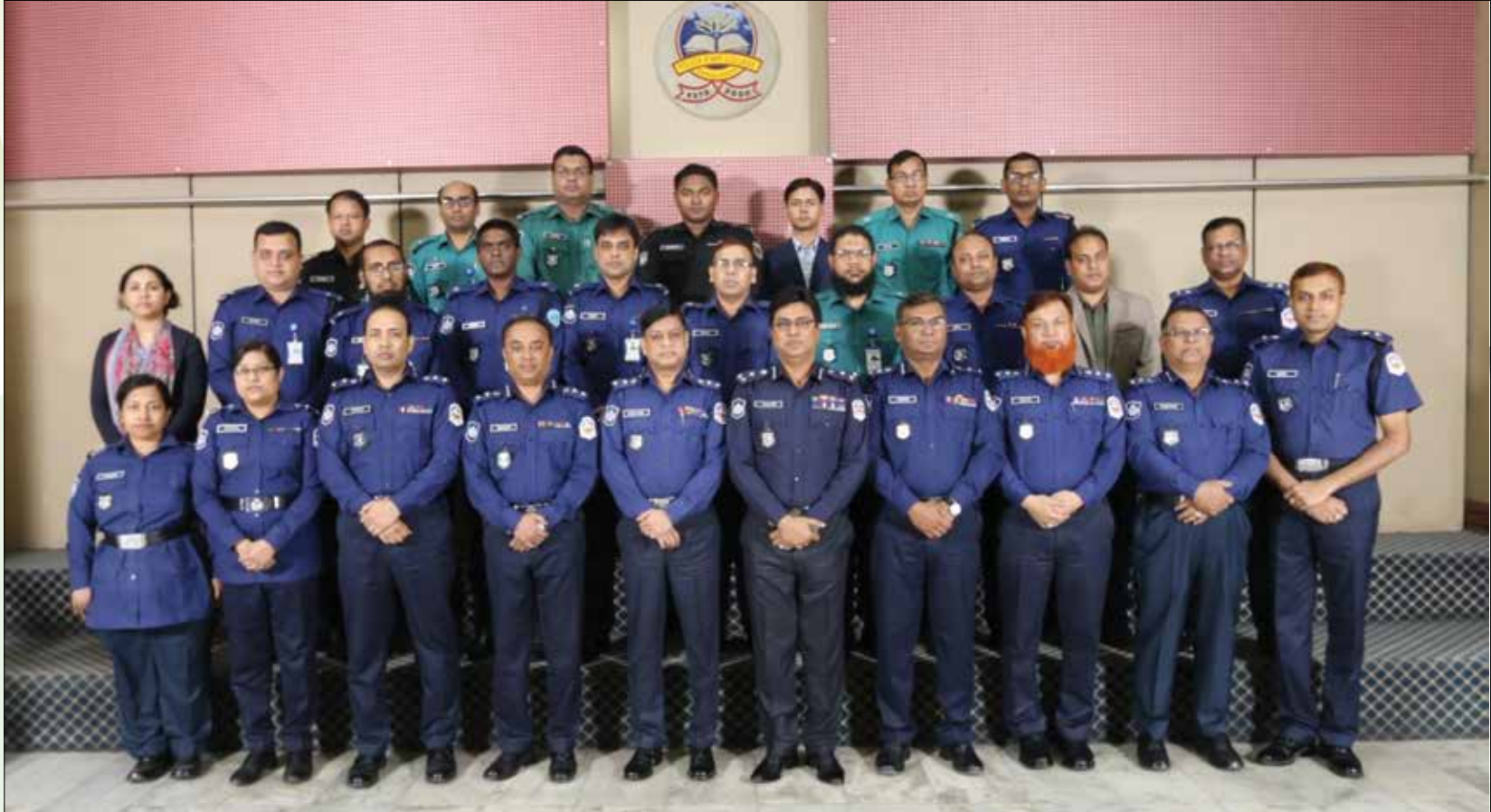
Participants of 38th Police Financial Management Course with the Faculty of PSC