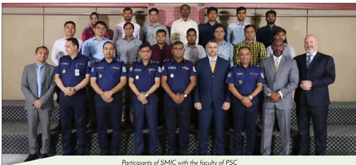
Participants of SMIC with the faculty of PSC

Social media investigation is unlike any other criminal investigation and it needs special training to build the skill. The participants of the course were tremendously benefitted from the course.