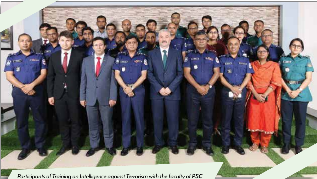
Participants of Training on Intelligence against Terrorism with the faculty of PSC