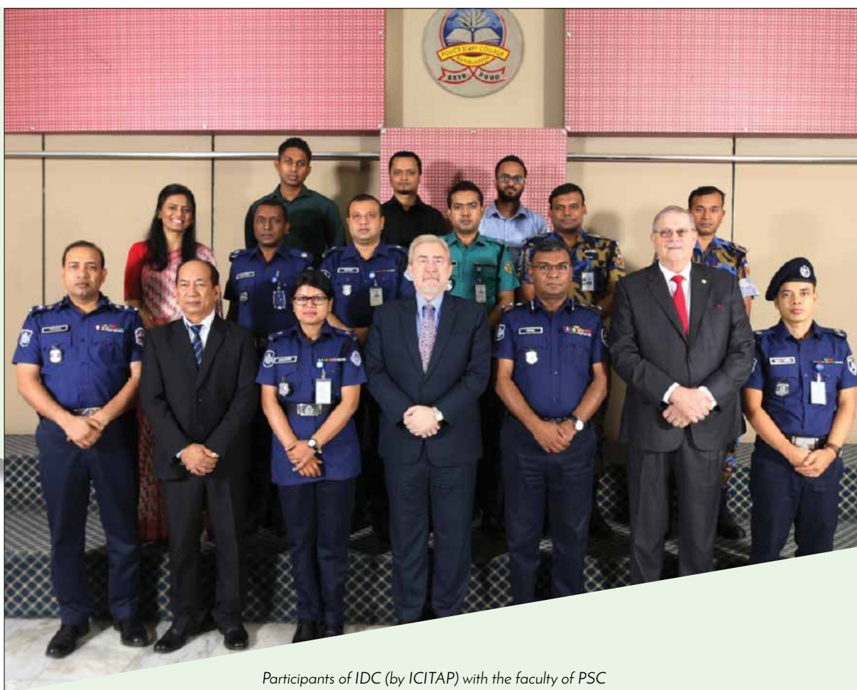
Participants of IDC (by ICITAP) with the faculty of PSC

The course was organized and conducted by ICITAP (International Criminal Investigative Training Assistance Program). The course content included the basics of adult learning, learning principles, learning objectives, lesson plans, the training cycle and process, learning styles, communication and motivation, effective media selection and use, curriculum development, effective training transfer, course preparation, final presentation and evaluation of the course.