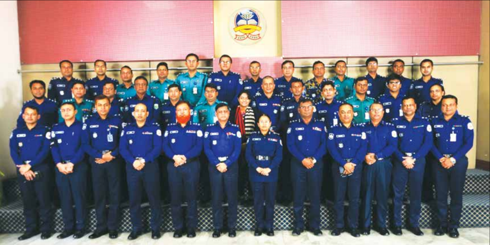
Participants of 44th Police Management certificate Course with the Faculty of PSC