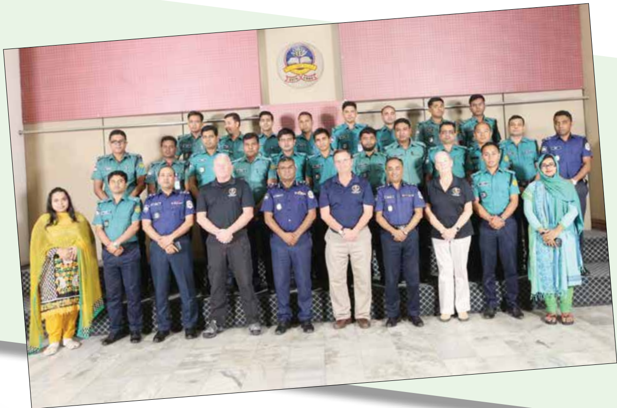
Participants of ITI Course with the Faculty of PSC

previous mentionable attacks, visiting the place of occurrence, collecting evidence, locating the terrorist through digital technology, forensic activities, analyzing previous terrorist records, use of modern digital tools and applications for investigation, compiling evidence systematically and proper prosecution method.