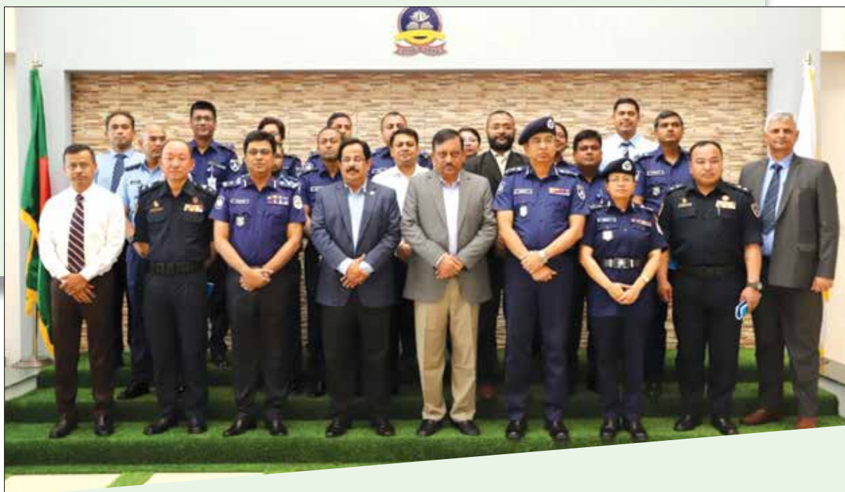
Participants of SAARC Course with the PSC Faculty