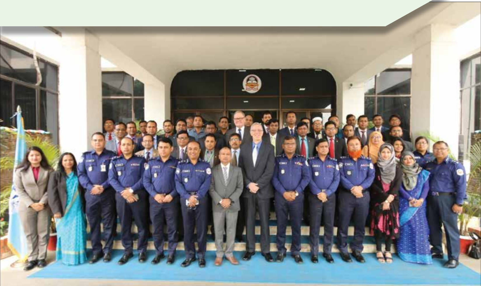
Participants of Training on the Fight against Pharmaceutical Crime and Products Affecting Consumer's Health with the Faculty of PSC

agencies so as to build capabilities in them to be able to successfully fight against such crime. The course content included scope of such crime, identification methods, legal provisions, penal options, prosecution system, awareness program, inter organizational cooperation and so on. The participants were immensely benefitted from the course.