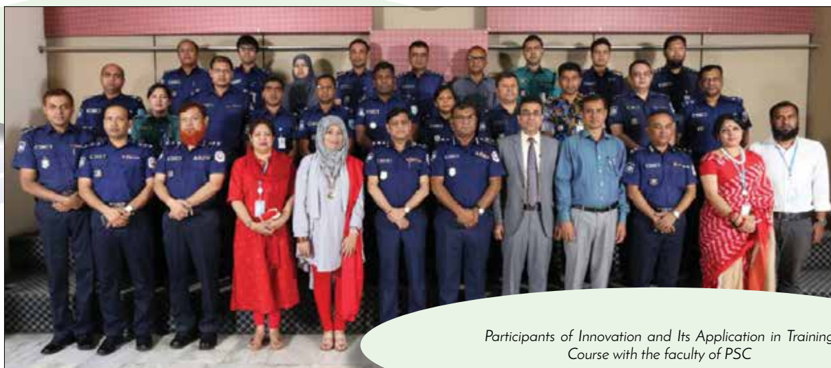
Participants of Innovation and Its Application in Training Course with the faculty of PSC

The course was organized and conducted by UNDP. Innovation is a skill, not a gift, and it can be learned like any other skill. Applying the skill of innovation in training can make conspicuous positive changes in the performance of trainees. The course contents included what innovation is, learning to innovate, various models of innovation, how to apply innovation in training, impact of application of innovation in training, how to make customized training courses applying innovation and so on.