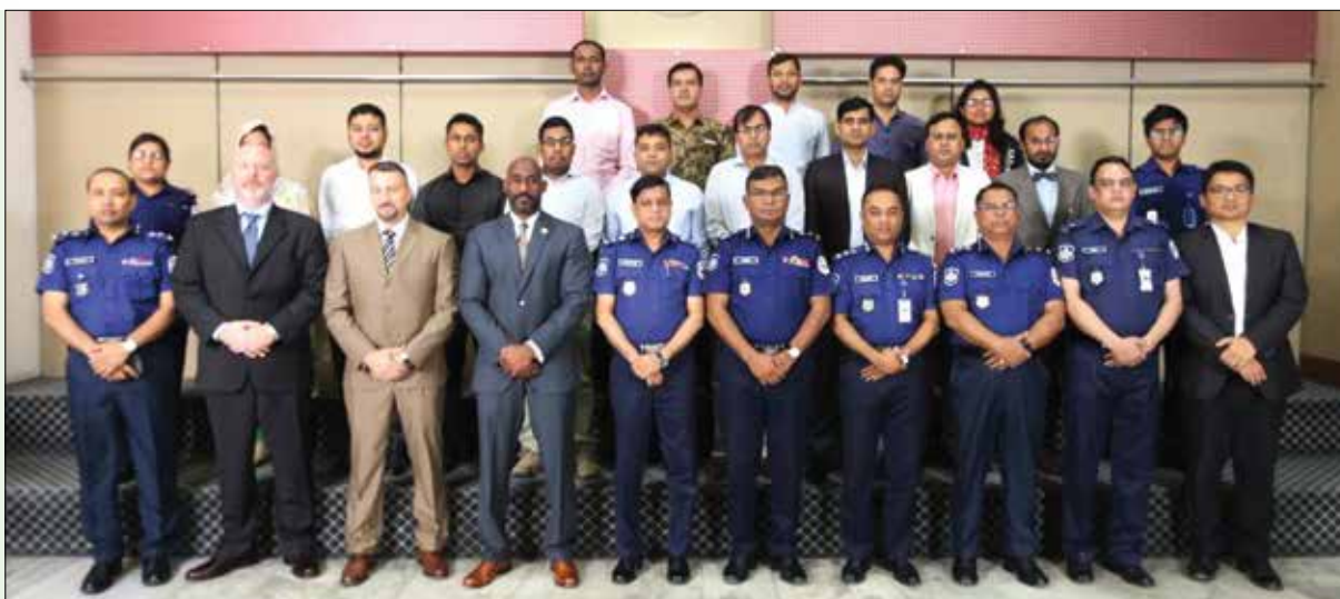
Participants of IDW Course with the Faculty of PSC

The course was organized by Anti Terrorism Assistance (ATA) of US State Department, US Embassy in Bangladesh. The Dark Web is a small section of the Deep Web that has been intentionally hidden and cannot be accessed through standard web browsers. It is an 'underground' medium which allows for the distribution of harmful information as well as for the browsing and purchasing of illegal goods and services, practically untraceable by law enforcement. Still, there are ways to investigate the dark web.