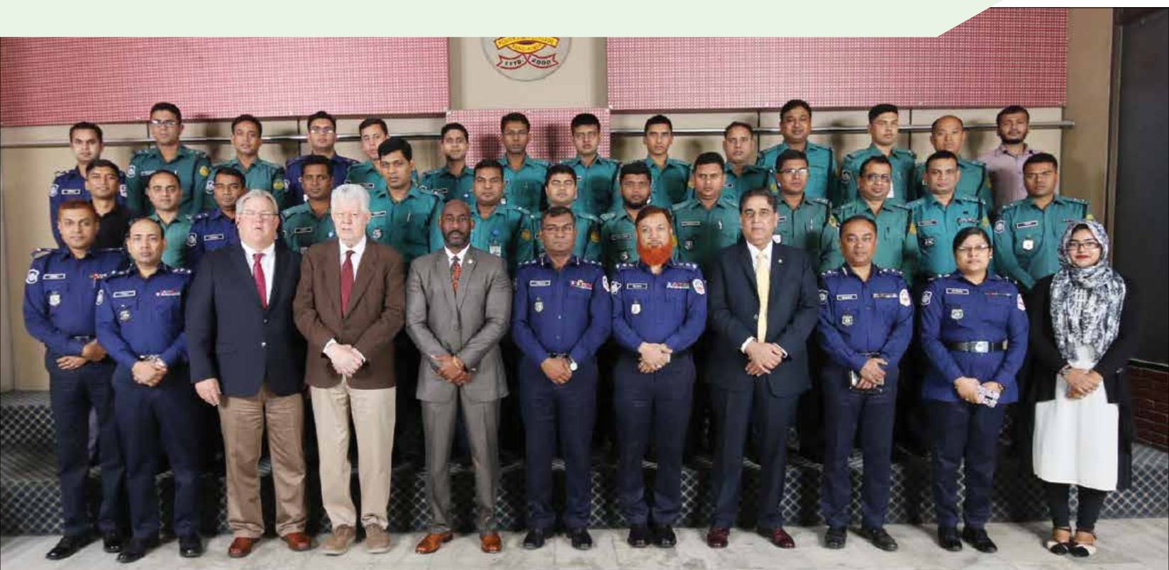
Participants of ITS Course with the Faculty of PSC

gathering, personality-focused approach, identifying specific communication skill of the suspect, ethical interviewing, rapport building, interpersonal communication theories, human rights, cognitive- and strategical interviewing technique, indirect assessments such as consulting records, interviewing partners, family members or friends and similar other issues.