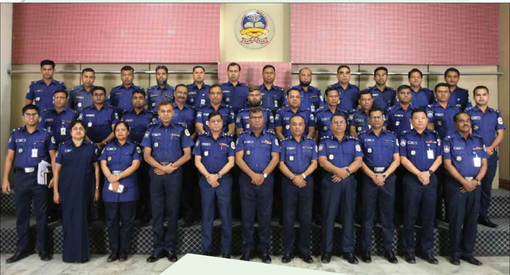
Participants of Investigation and Prosecution Certificate Course for PBI Officers with the Faculty of PSC

(First Information Report) to submitting Police Report like PO visit, Case Diary writing, collecting evidence, interviewing the witnesses, inquest report, case docket analysis, strength and weaknesses in document writing, use of technology in investigation, producing flawless Police Report and so on.