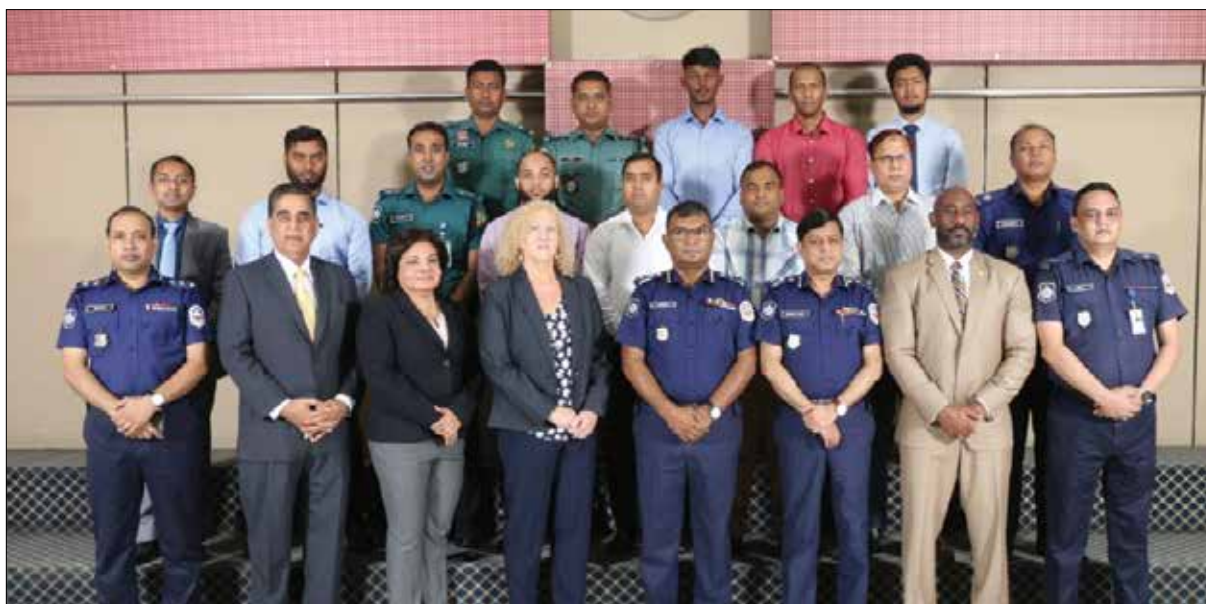
Participants of IDC (by ATA) with the faculty of PSC

The course was organized by Anti Terrorism Assistance (ATA) of US State Department, US Embassy in Bangladesh. The course contents included instructional strategies, module equipment/facilities, supporting materials, facilitating adult learning, Community engagement and human rights, presentation and facilitation skills, work with workbook, group work, managing the classroom, training preparation, training evaluation and documentation, final presentations, summary and evaluation. This is a useful course that can transform an officer to a skilled instructor and facilitator in adult learning.