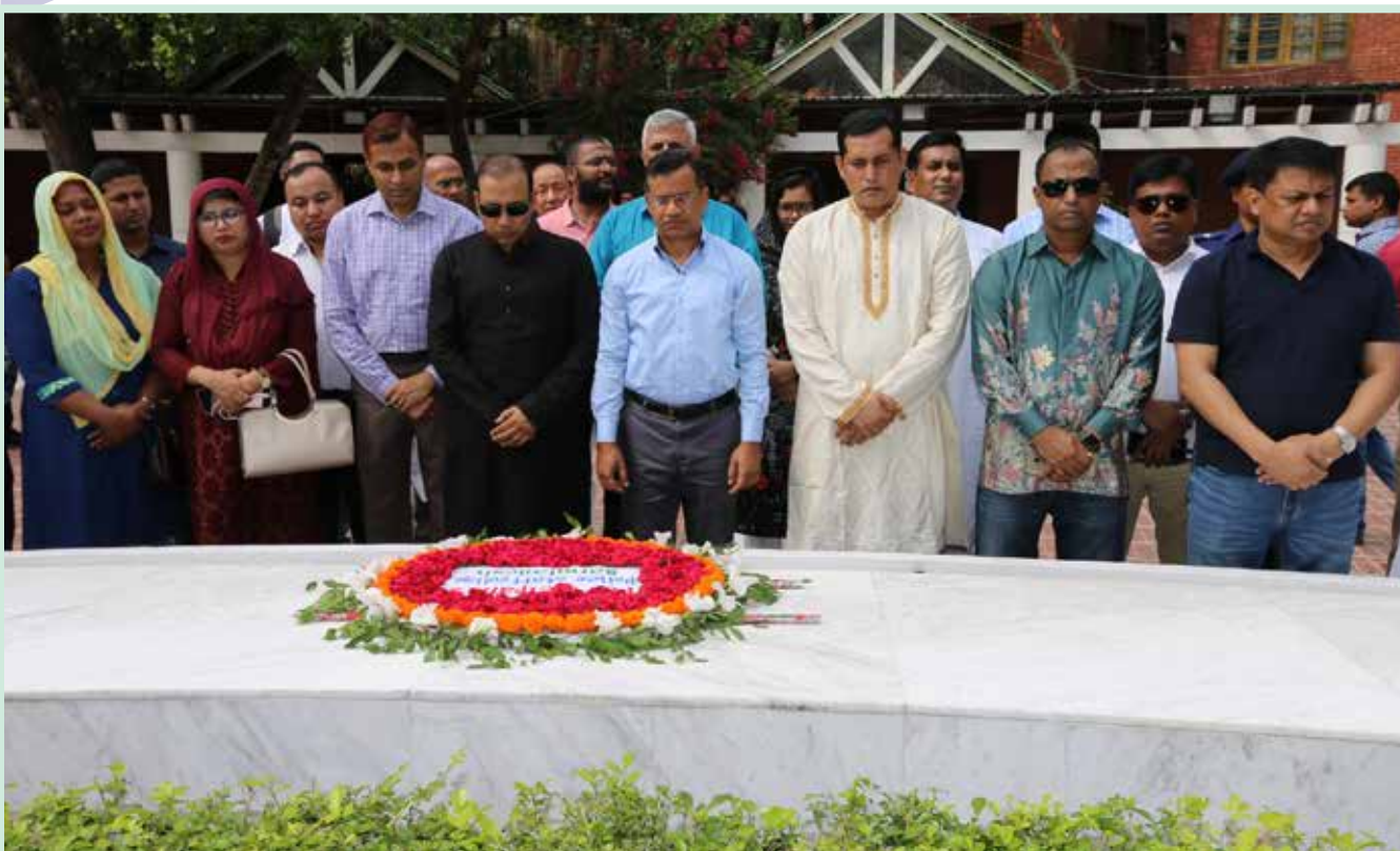
Participants of SAARC Course with the PSC Faculty in front of Mausoleum of the Father of the nation Bangabandhu at Tungipara in Gopalganj