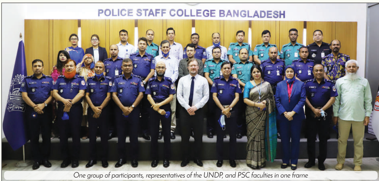
One group of participants, representatives of the UNDP, and PSC faculties in one frame