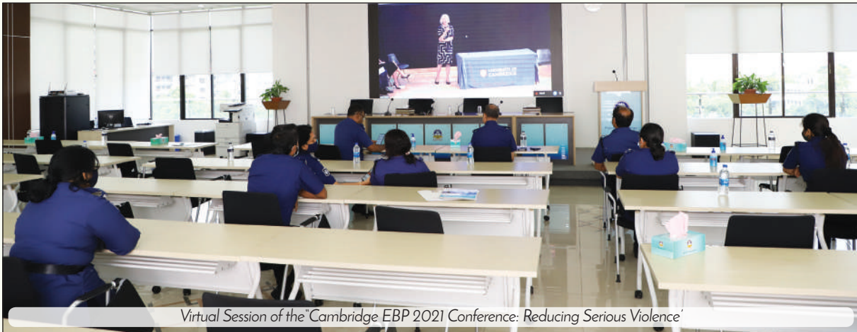
Virtual Session of the "Cambridge EBP 2021 Conference: Reducing Serious Violence"