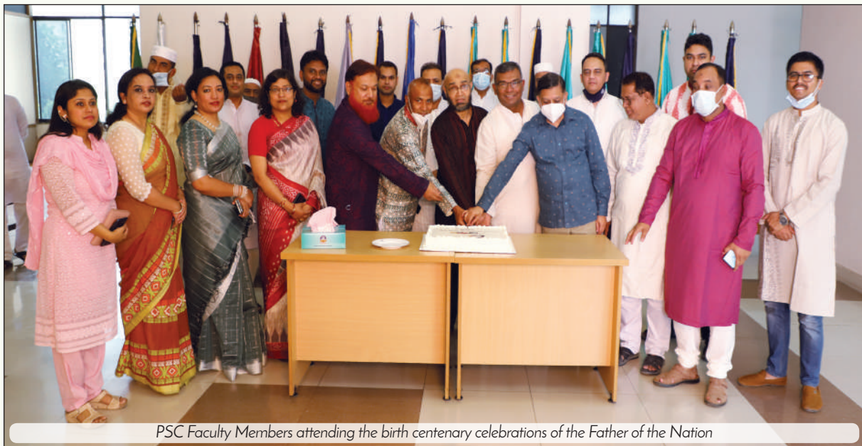
PSC Faculty Members attending the birth centenary celebrations of the Father of the Nation

On occasion of the centennial birth anniversary of the founding leader of Bangladesh, Sheikh Mujibur Rahman, the Government of Bangladesh declared the year 2020-21 as the Mujib Borsho (Mujib Year). Celebrated from March 17, 2020 to December 16, 2021, the Mujib Year has been marked with nationwide activities and events.