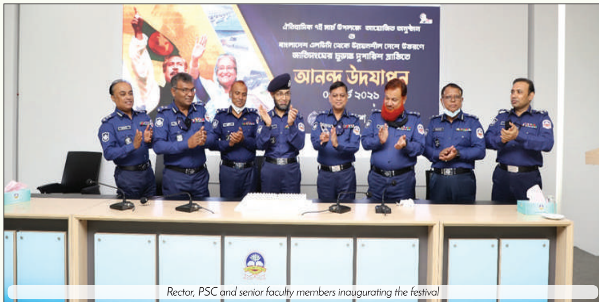
Rector, PSC and senior faculty members inaugurating the festival

The country graduated from the list of the least developed countries (LDCs) to become a member of the Lower Middle Income Country (LMIC) club. Celebrating this national achievement in tandem with the 50th year of the nation's independence, Prime Minister Sheikh Hasina virtually inaugurated the nationwide program. Joining in with participants from all over the country, PSC faculty members attended the occasion via virtual media.