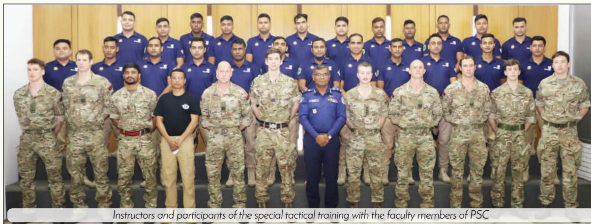
Instructors and participants of the special tactical training with the faculty members of PSC