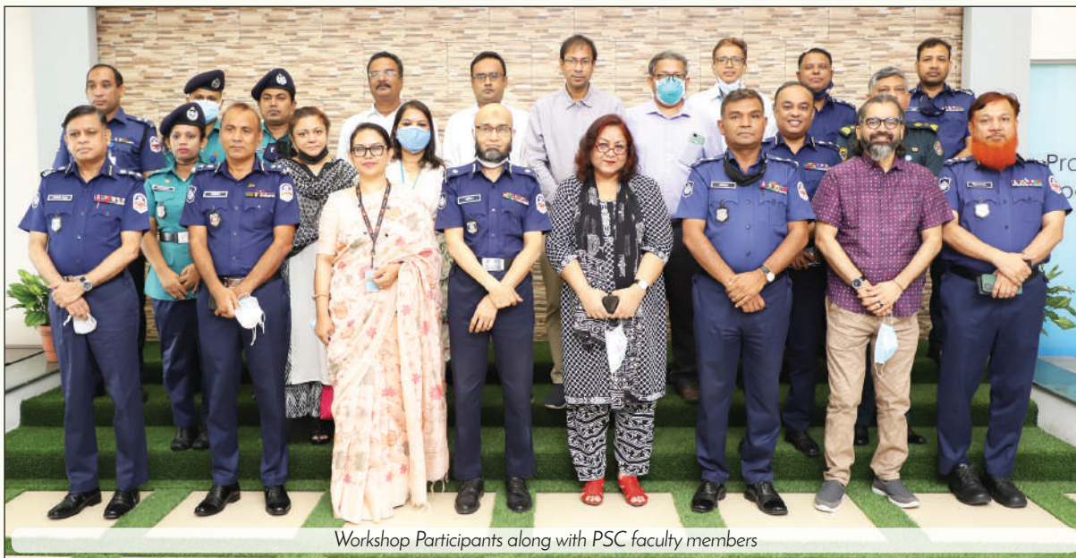
Workshop Participants along with PSC faculty members