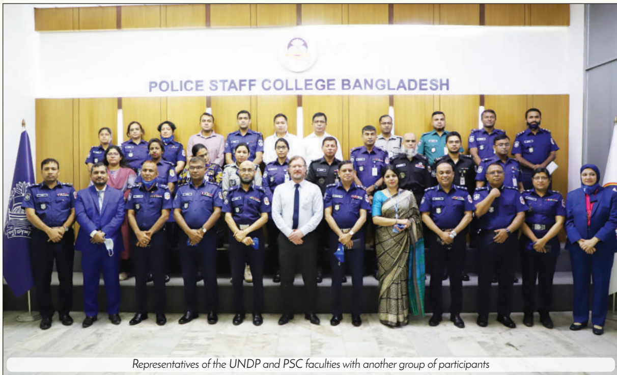
Representatives of the UNDP and PSC faculties with another group of participants