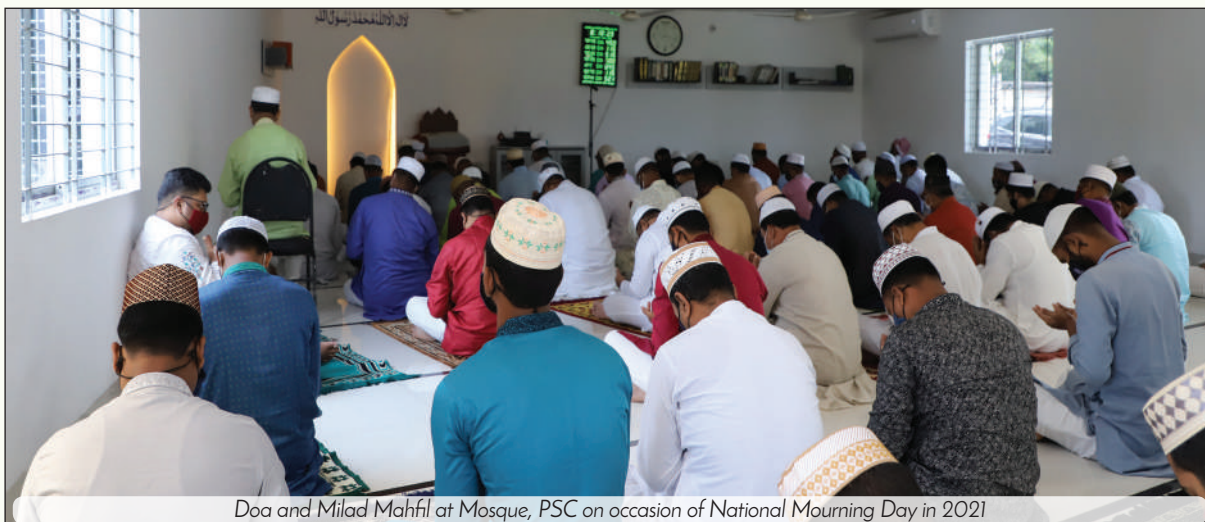
Doa and Milad Mahfil at Mosque, PSC on occasion of National Mourning Day in 2021

Paying sincere tribute to the memory of the Father of the Nation, Bangabandhu Sheikh Mujibur Rahman on his 46th martyrdom anniversary, PSC observed the National Mourning day on 15th August 2021 with somber remembrance and collective prayers. On the day, the national flag was hoisted at half-mast at top the admin building of PSC. Communal prayers and milad mahfil was held at the central mosque of PSC after Zuhr (midday) prayers. The overall event plans had to be scaled down due to concerns over the Covid-19 pandemic.