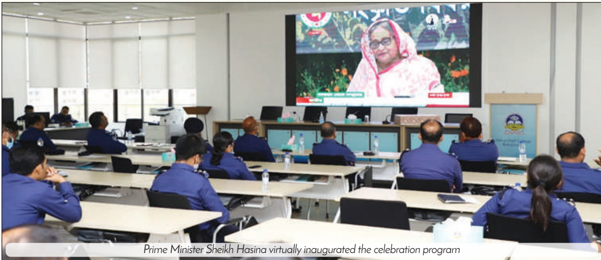
Prime Minister Sheikh Hasina virtually inaugurated the celebration program

Police Staff College Bangladesh organized a combined event remembering Bangabandhu's 7 March Speech and celebrating Bangladesh's changed status to a lower middle income country. The historic speech given by Bangabandhu on 7 March during the Liberation War in 1971 spurred the nation to achieving freedom through a nine-month long armed struggle. The speech, recognized by UNESCO as part of the world's documentary heritages, is emblematic of the Bengali nation's history and yearning for freedom. PSC added to the discourse analyzing this historic speech through insightful discussions on the implications of the 7 March speech and Bangabandhu's vision for a developed Bangladesh.