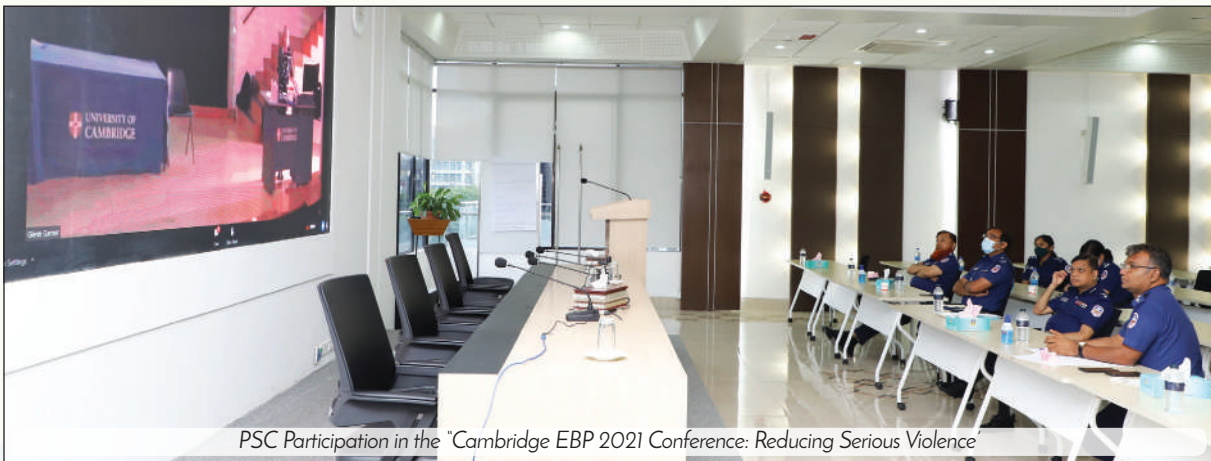
PSC Participation in the "Cambridge EBP 2021 Conference: Reducing Serious Violence"