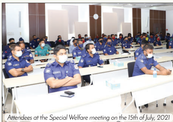
Attendees at the Special Welfare meeting on the 15th of July, 2021