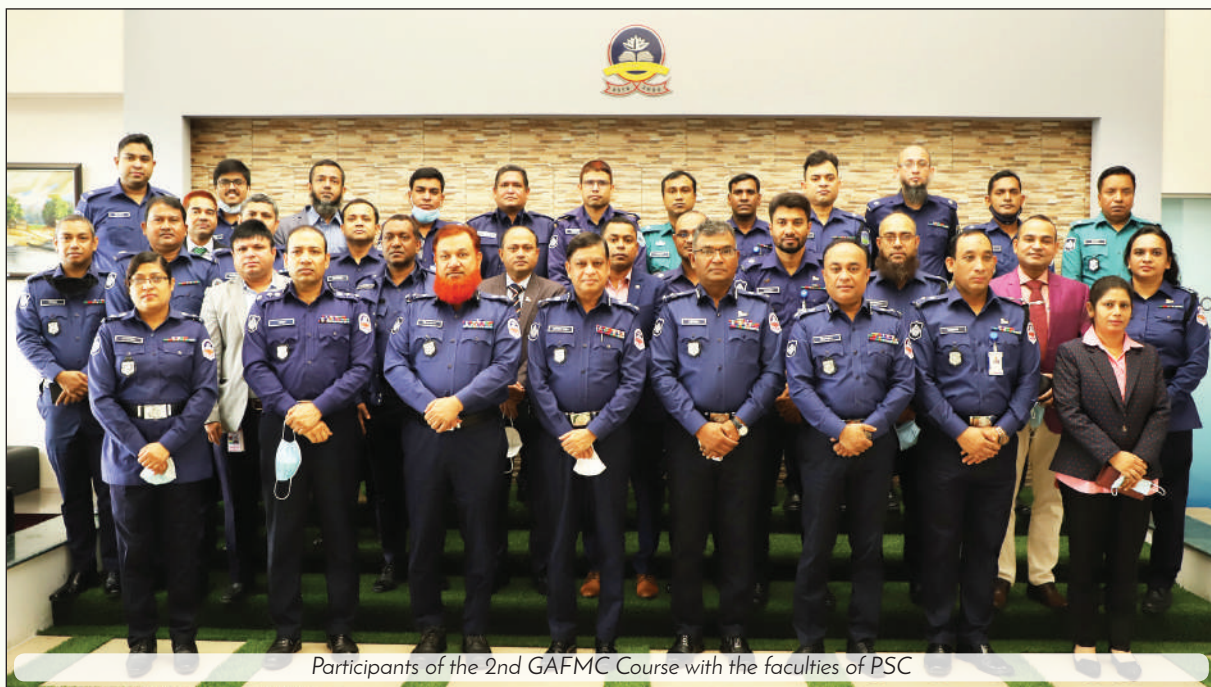
Participants of the 2nd GAFMC Course with the faculties of PSC

GAFMCC is designed for imparting knowledge on Administration and Financial Management to mid-level officials of Bangladesh Police. The first trainees joining this course belong to the 27th BCS (Police) batch. All officers of the rank of Additional SP of Bangladesh Police undergo this mandatory training.