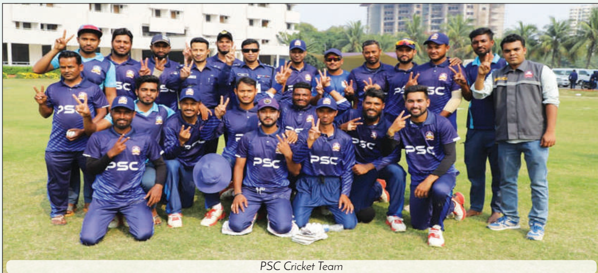
PSC Cricket Team

The cricket field, along with the futsal facility, has greatly added to the sports and athletic endeavors of PSC.