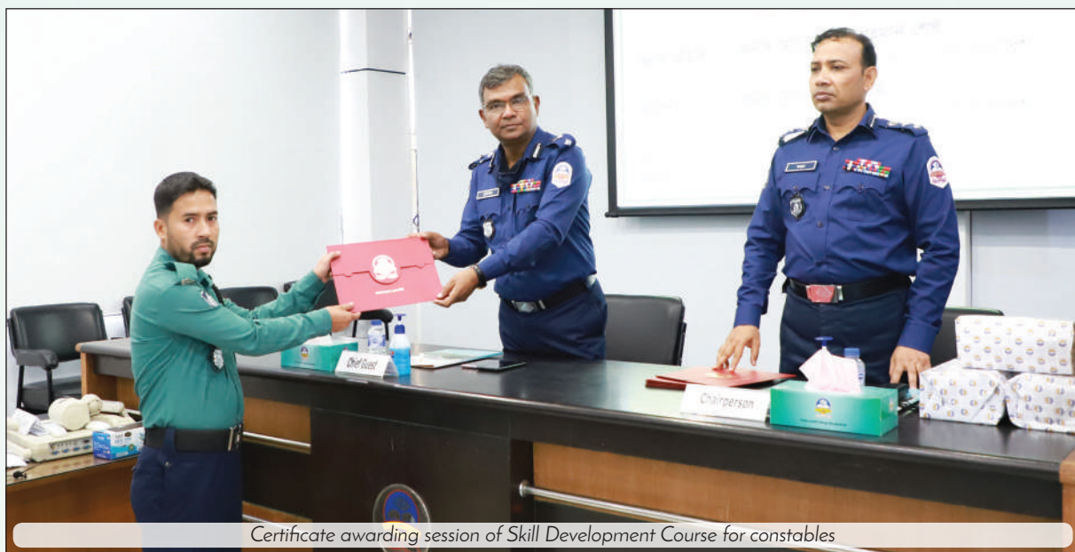
Certificate awarding session of Skill Development Course for constables