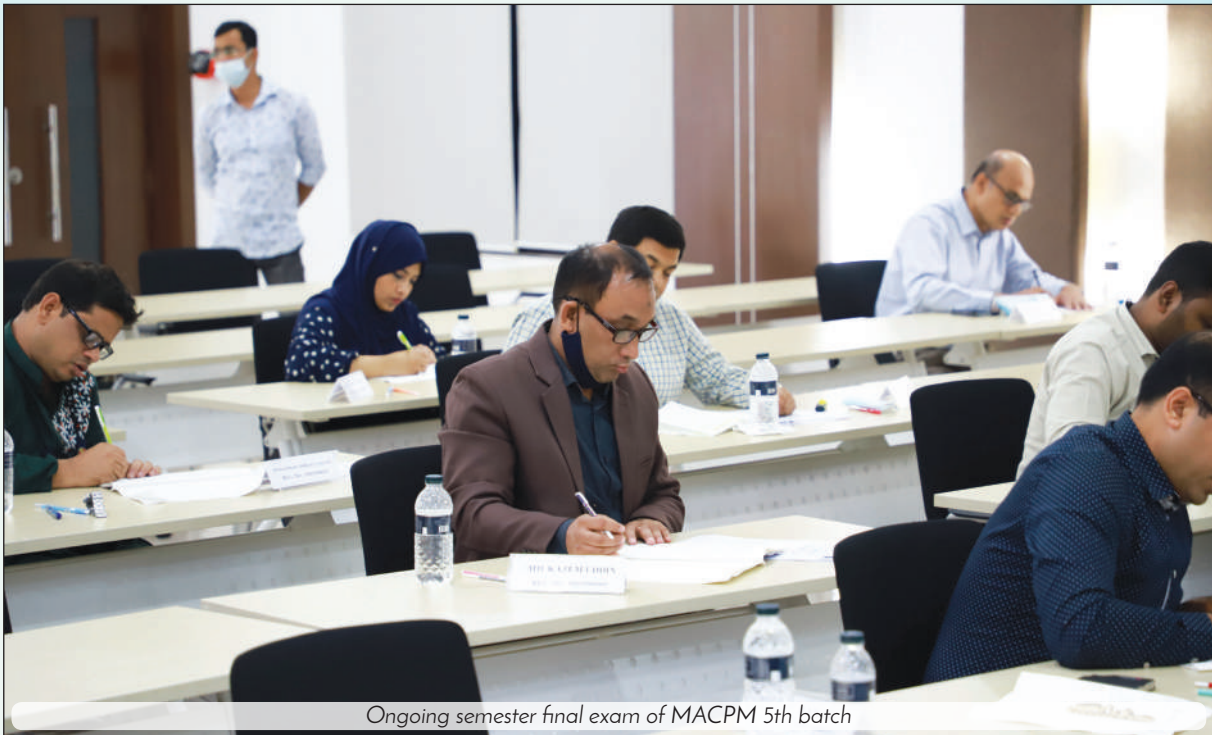
Ongoing semester final exam of MACPM 5th batch

The Academic Branch of Police Staff College (PSC) has been conducting the Master of Applied Criminology and Police Management since 2016. Already four batches have graduated from the MACPM program. This program has stood out due to the inclusion of modern criminological and law enforcement topics in its syllabus, and the unique blend of theoretical and practical titles in its course curriculum.