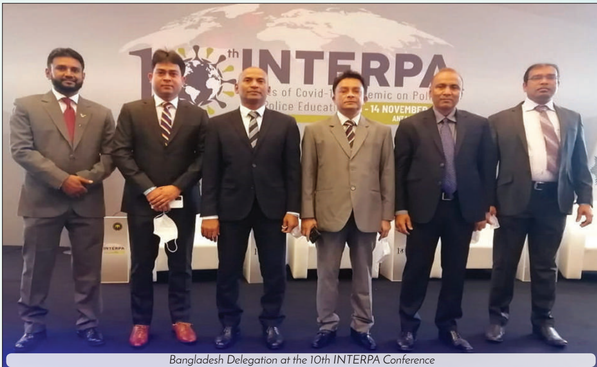
Bangladesh Delegation at the 10th INTERPA Conference

The conference was arranged with the theme of "Effects of COVID-19 Pandemic on Policing and Police Education". Over 153 participants from 40 countries attended the conference. The participants shared The event was organized by the Turkish National Police Academy (TNPA). The Conference was composed of 3 sessions: