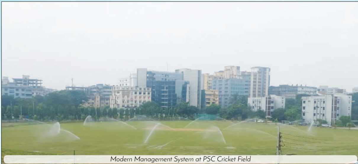
Modern Management System at PSC Cricket Field

Under the constant supervision and direct involvement of the officials of the Administration wing of PSC, there is now a professional standard cricket field in the premises. The field is located to the west of the PSC office building. It boasts multiple world-class pitches, modern drainage systems and a well-managed grass surface. There are practice nets in the southwestern corner for both bowling and batting practice.