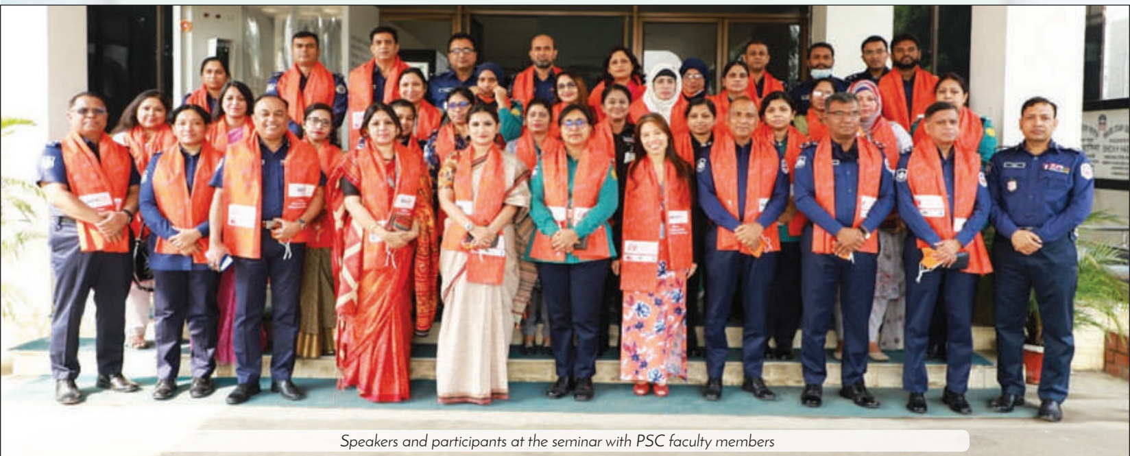
Speakers and participants at the seminar with PSC faculty members

The major areas requiring attention were found to be lack of awareness among common people regarding laws, the conservative nature of criminal justice institutions and inadequacy in proper implementation of legal mechanisms. Several recommendations were made, including strengthening the existing legal framework to comprehensively review the laws in existence and assess their implementation with the aim to end violence against women in Bangladesh. It was proposed to establish special women’s police stations, staffed with multi-disciplinary female teams equipped to respond to the different needs of victims or survivors. It was also recommended to assess the effectiveness of current initiatives, including Victim Support Centers and hotlines to identify the most effective interventions in gender-based violence cases.