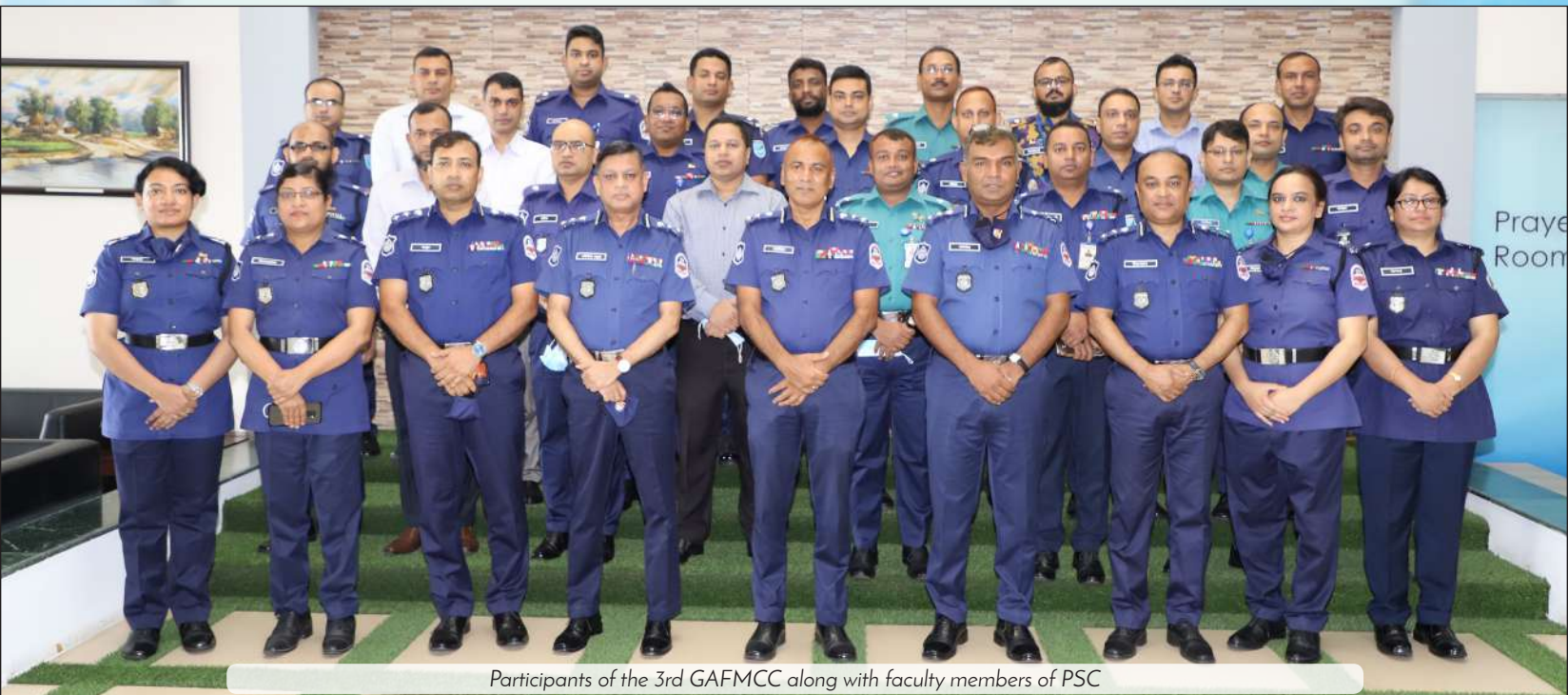
Participants of the 3rd GAFMCC along with faculty members of PSC

This course is designed for imparting knowledge on administrative strategies and financial management, with a view to preparing participants for future leadership roles.