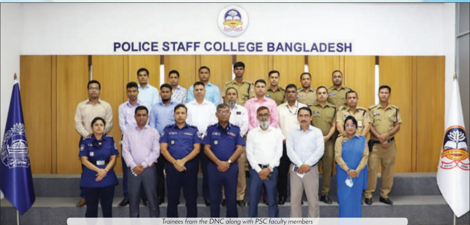
Trainees from the DNC along with PSC faculty members

A training course related to intelligence collection, investigation of cases and conduction of prosecution was conducted at PSC for the officers of the Department of Narcotics Control (DNC). The Course was aimed at providing investigators and prosecutors alike with the basic knowledge in order to properly investigate and prosecute offences. The duration of the course is two weeks. Participants from Inspector to Deputy Directors of the DNC learned various topics, such as: writing of Case Diary, analysis of Memorandum of Evidence, Further Investigation, revival of cases etc. the course was conducted from 24th October 2021 to 4th November 2021. Participants opined that the course could be followed up by more advanced courses. This course was coordinated by Arifa Ashraf (Assistant Director-Training)