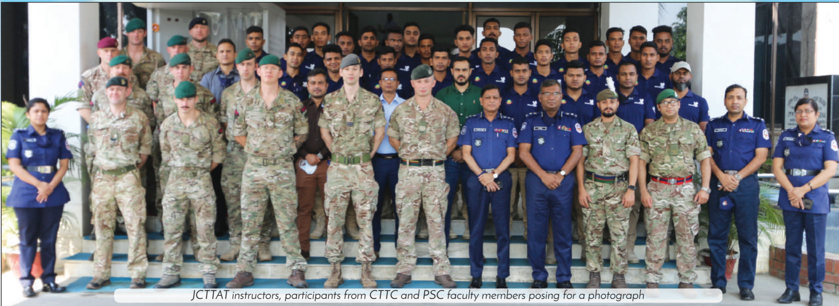
JCTTAT instructors, participants from CTTC and PSC faculty members posing for a photograph

The United Kingdom Strategic Command's Joint Counter Terrorist Training Advisory Team (JCTTAT) & UK High Commission, Dhaka facilitated the jointly organized SWAT Operator Course (Ex Tiger Claw-21) from 29th October 2021 to 19th November 2021. Officers and specially trained constables of the Counter Terrorism & Transnational Crime (CTTC) unit of Bangladesh Police attended this special course.