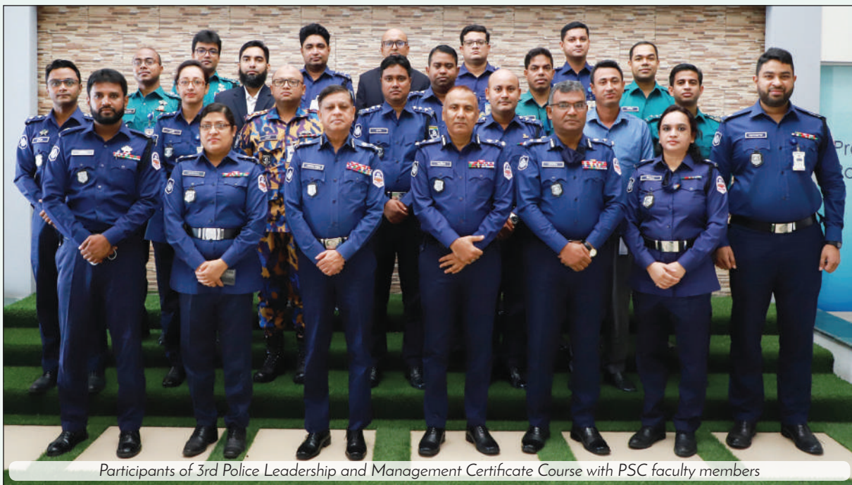
Participants of 3rd Police Leadership and Management Certificate Course with PSC faculty members

The third batch of students for this course began attending sessions after the inauguration on 5 December 2021. Scheduled to end on 20 January 2022, police officers of the rank of ASP from 34th BCS (Police) batch joined this 8-week long course. After the completion of 7 weeks of classes in PSC, the participants will be sent to a foreign exposure visit for one week as part of their journey in enhancing professional skill & knowledge.