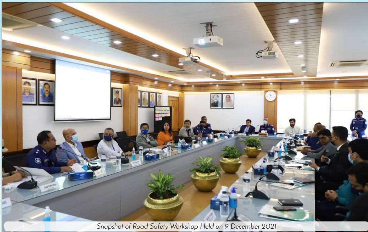
Snapshot of Road Safety Workshop Held on 9 December 2021