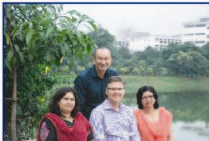
Instructors of Initial Investigation Course sitting by the Pond