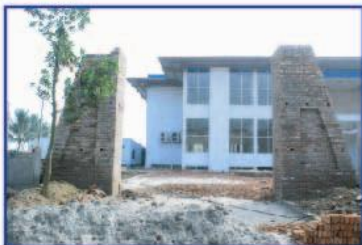
Approach Road and gate of PSC Convention Centre