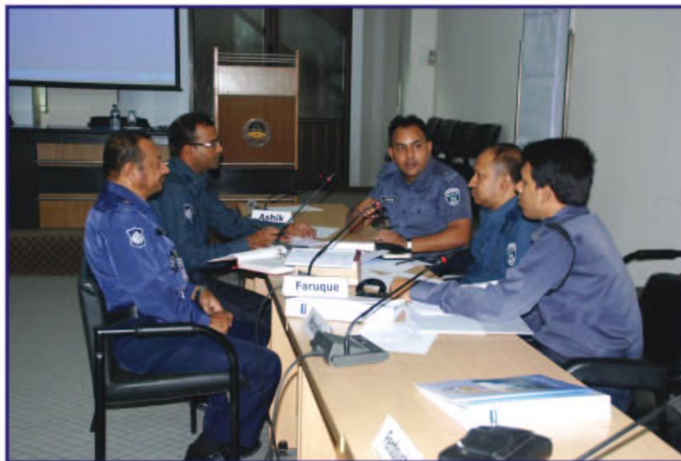
Participants in a group work in 2 nd Comprehensive Police Case Management Course