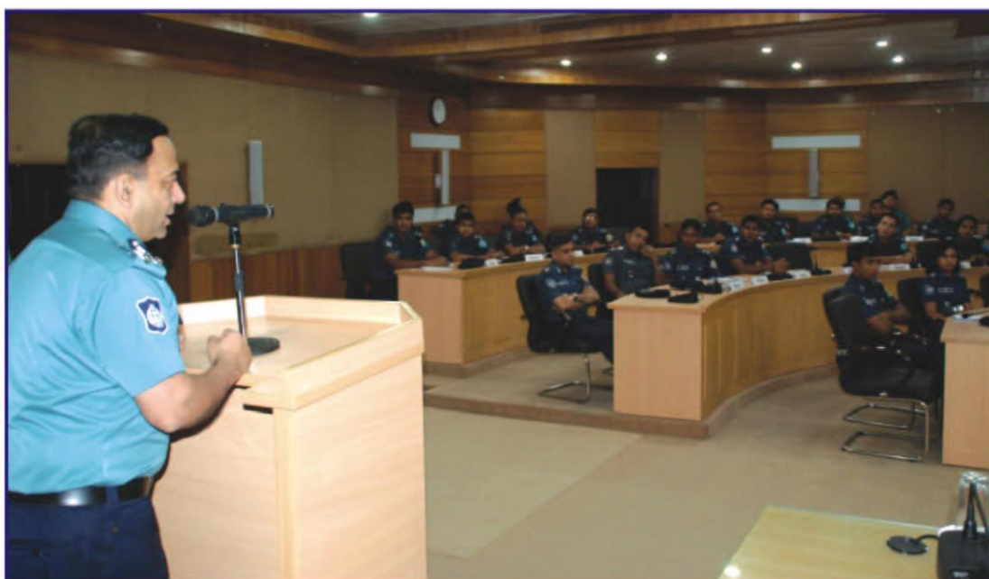
Mr. Benazir Ahmed BPM (bar) , Commissioner, DMP conducting a session of 1 st Course of Clarity on Functional Policing

All the participants demonstrated satisfactory performance in the post course exam and other activities. After the course being completed, the participants recommended that this course be made mandatory for the ASP Probationers in the middle of their district attachment tenure so that the probationers can get this ample opportunity to clarify their doubts they faced during their probation period. They also recommended this course to be at least of two weeks with more practical interpretation of contemporary policing issues. Being aware of their upcoming challenges, they demanded for more specialized courses.